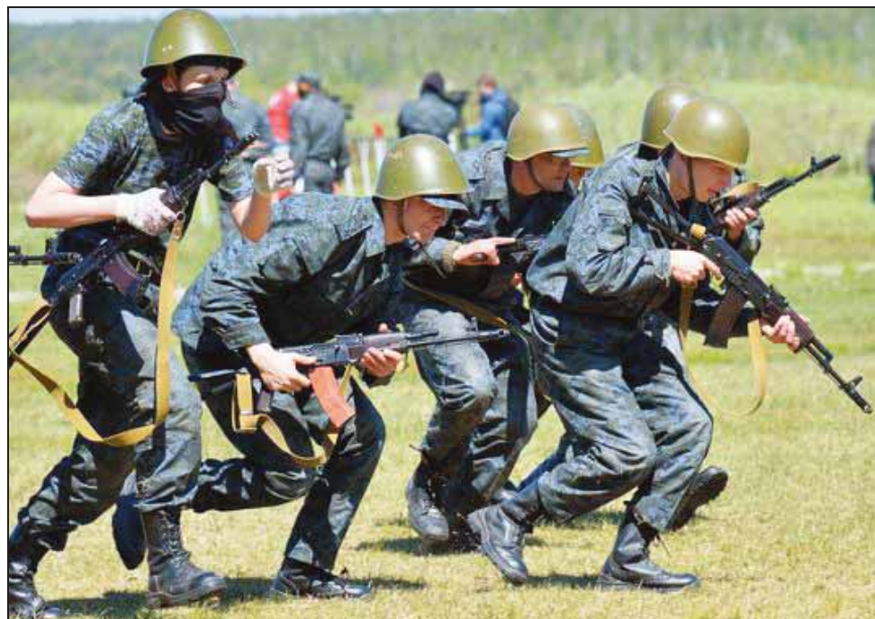
Recruits take part in military exercises at the shooting range of the Ukrainian National Guard near the village of Novy-Petrivtsi not far from Kiev on May 8.

“I’ve been here only for three days, but I’ve realised that it’s not a camp where you just play