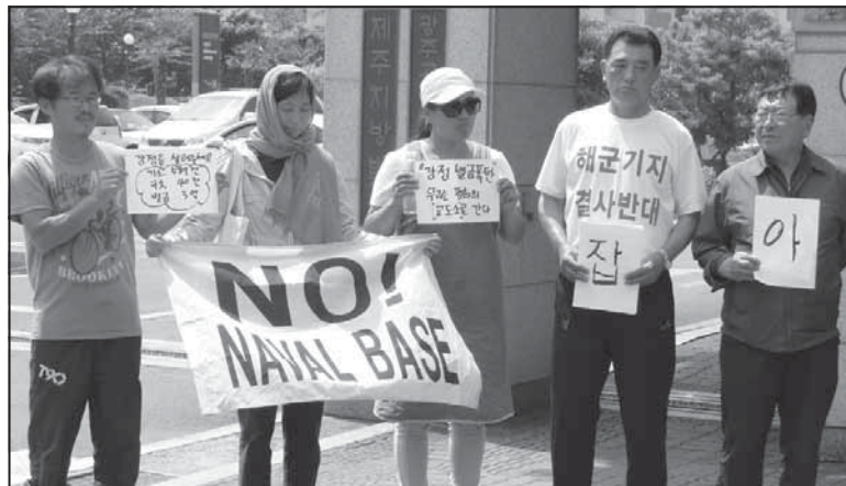
Outside the Jeju Courts - refusing to pay fines for protesting against the US naval base construction.

They wanted to protect the environment, sacred Gureombi rock, the offshore endangered soft coral