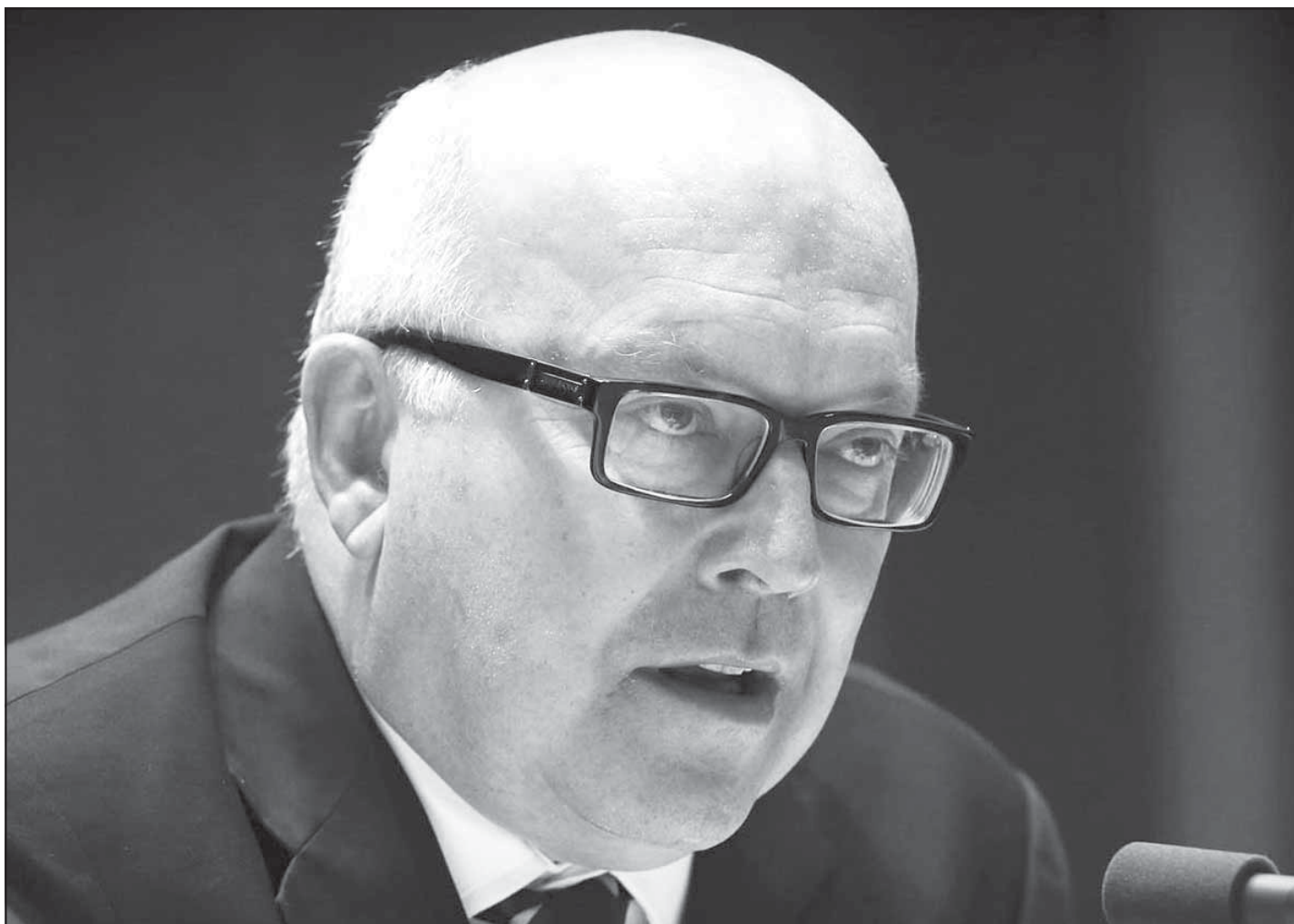
Our frankly evil Attorney General is calling it a "crackdown on vigilante green groups". Bullshit, Mr Brandis.

Did I say something earlier about this mob's arrogance? Al Capone had a similar attitude. (And similar politics.) ☘