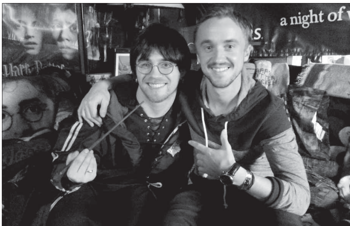
Tom Felton (on the right) with a fan – Tom Felton Meets the Superfans (ABC2 Wednesday September 16 at 8.30pm).

He visits the British manifestation of the global phenomenon known as Comic Con and dresses up as The Joker to "blend in". There