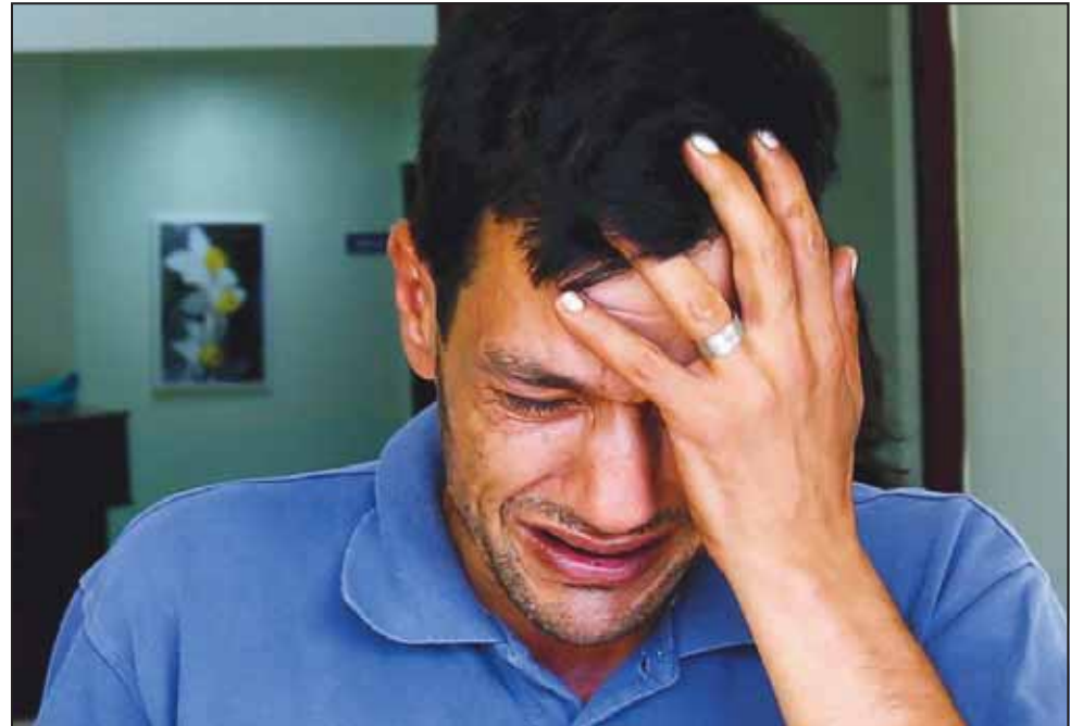
Father of Syrian boy washed up on Turkish beach recalls boat horror.