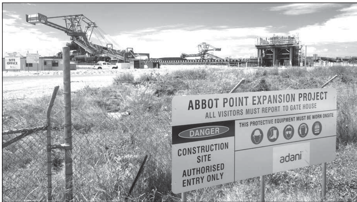
Abbot Point – The Carmichael project is facing major hurdles on several fronts.