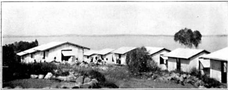
Photograph "B"—Darwin Leprosarium.