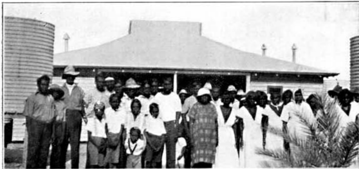
Photograph "C"—West Australian Patients at Darwin Leprosarium.