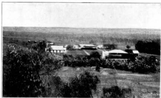
Photograph "G"—Kummunya Mission, Port George IV.