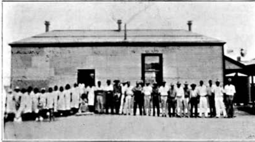
Photograph "A"—Native Hospital, Port Hedland.