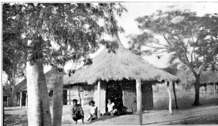
Photograph "E"—Forrest River Mission.