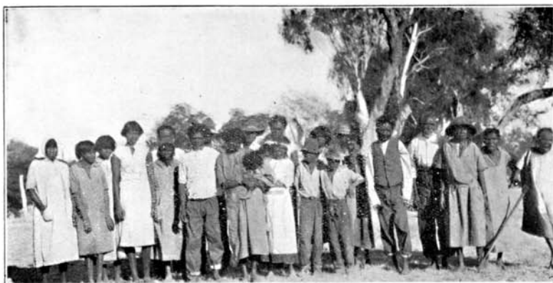
Photograph "D"—Natives at Violet Valley Station.