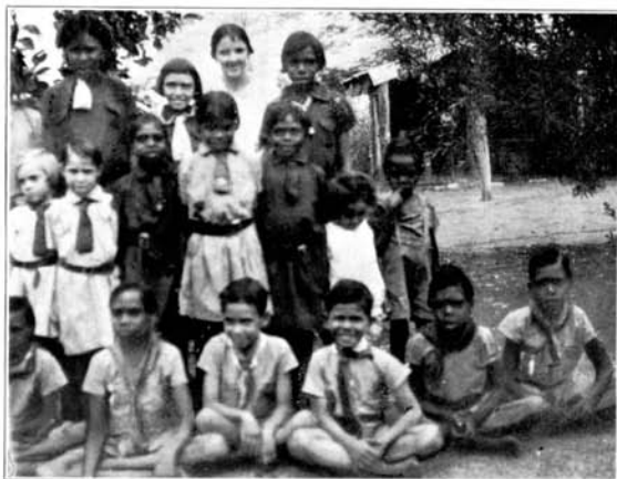
Photograph "I"—Teacher and Children at Kummunya Mission School.