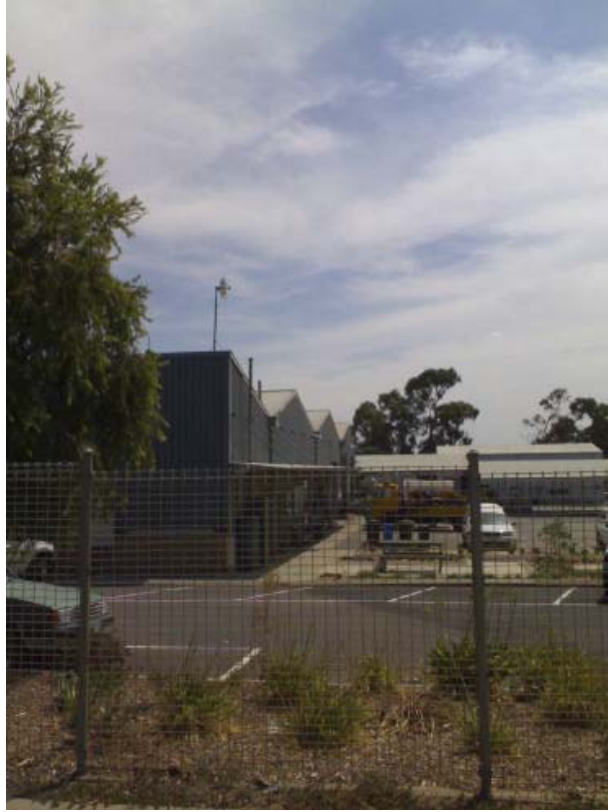
Adam St Depot