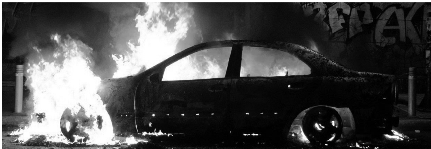
Car burning during solidarity demonstration March 17th in Athens.

8 March 2015 (Athens, Greece): Central offices of the government