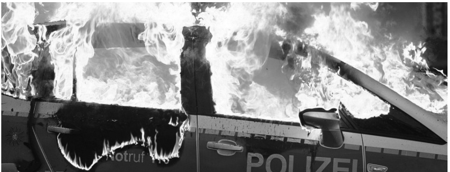
Burning cop car in Frankfurt, Germany.

26 March 2015 (Dortmund, Germany): A van belonging to Nazis burnt, and a Nazi party office attacked.