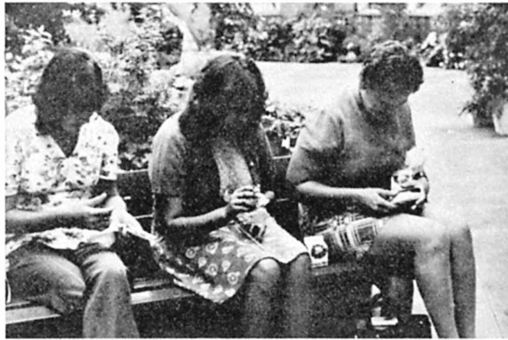
Teachers Aid Trainees during a break in lectures

communities and the local schools and the Education System in general. Since they were working at their local school, they found they could fit into the school situation quite easily and felt that their communities would be able to approach them on education problems.