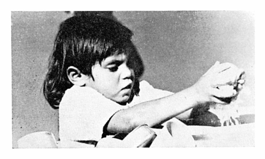
Brewarrina S.C.F. Pre-school