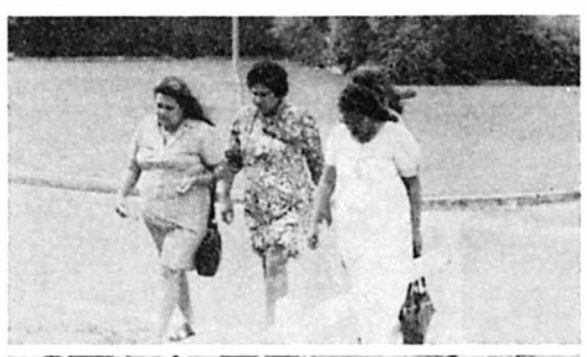
Aboriginal Health Staff arriving for the Seminar