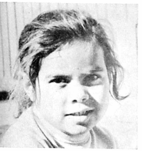
Children from Green Hill, Kempsey S.C.F. Pre-school