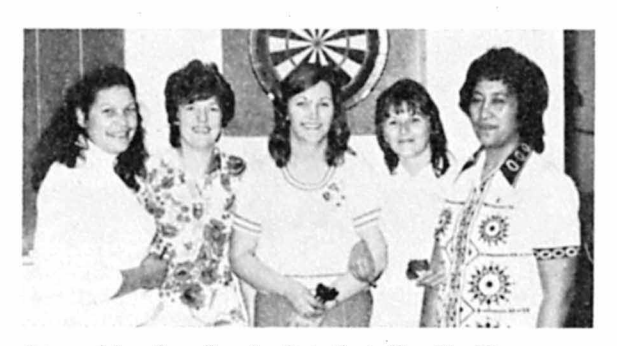
Representatives from Zone 6-State Darts Championships

Two ladies from this group also represented N.S.W. in the Australasian Championships in Sydney.