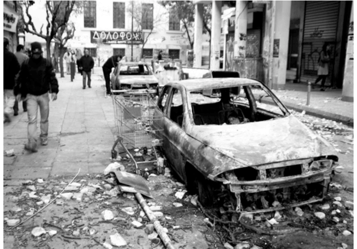
Athens, Exarhia, December 2008

The media said that 4500 tear gas canisters have been used by the police these 5 days. They are running out of tear gas and think of importing some from Israel!