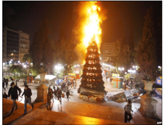
The Christmas tree in Syntagma square is burning, Monday 8.12. Sorry, no Christmas this year, we're having a riot.

At 6pm, the Faculty of Law squat called for a demonstration at Propylaia, a central Square of Athens. Our estimation is that more than 20.000 people, mainly young people, participated in that demo. Lots of them, maybe more than 1.500, were walking "in and out" of the demo smashing banks and destroying the luxurious shops of the city centre. They started to destroy or loot the commodities almost from the first moment of the demo. The youths destroyed banks at Omonoia square and attacked more than half of the shops of Stadiou Avenue and Filellinon Avenue. Also, severe looting took place at the shops in the first blocks of Piraeus