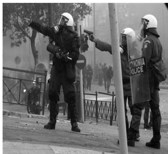
Athens, the day after Alexandros' death: a policeman aiming at demonstrators, the second one pretending to be doing so. On 9.12 in Patra, police shot rubber bullets at the demonstrators.

It has to be noted that the news concerning the murder of the young boy immediately spread