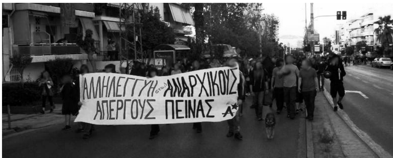
Solidarity to the hunger strikers