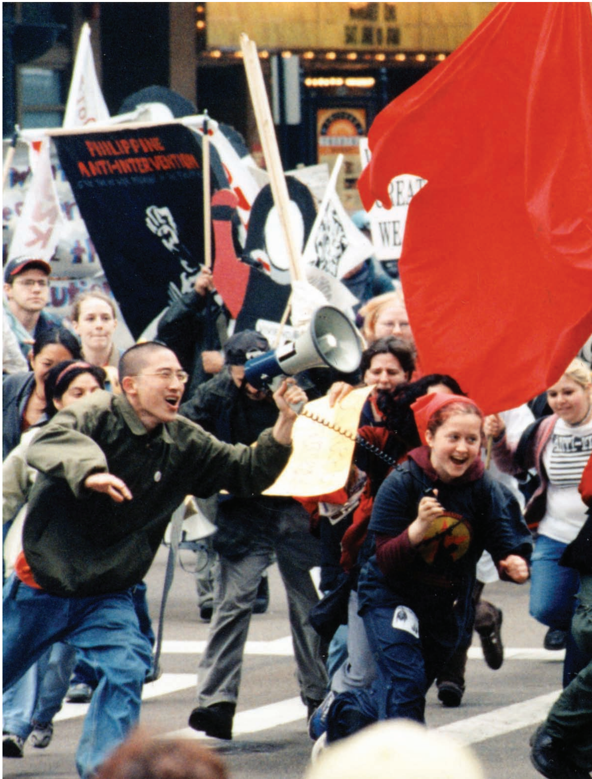
May First.