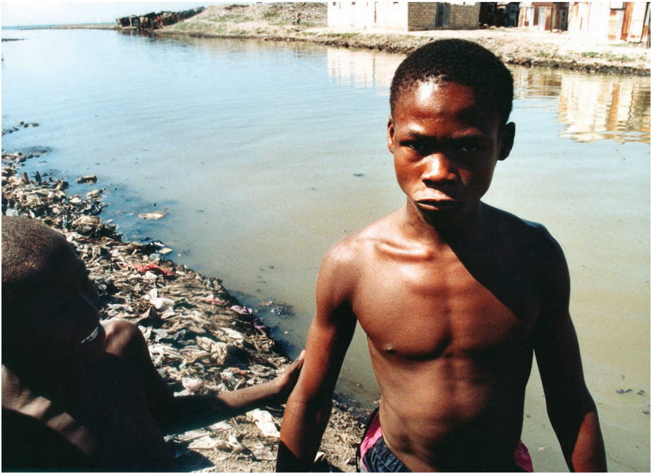
Cite Soley, Haiti.