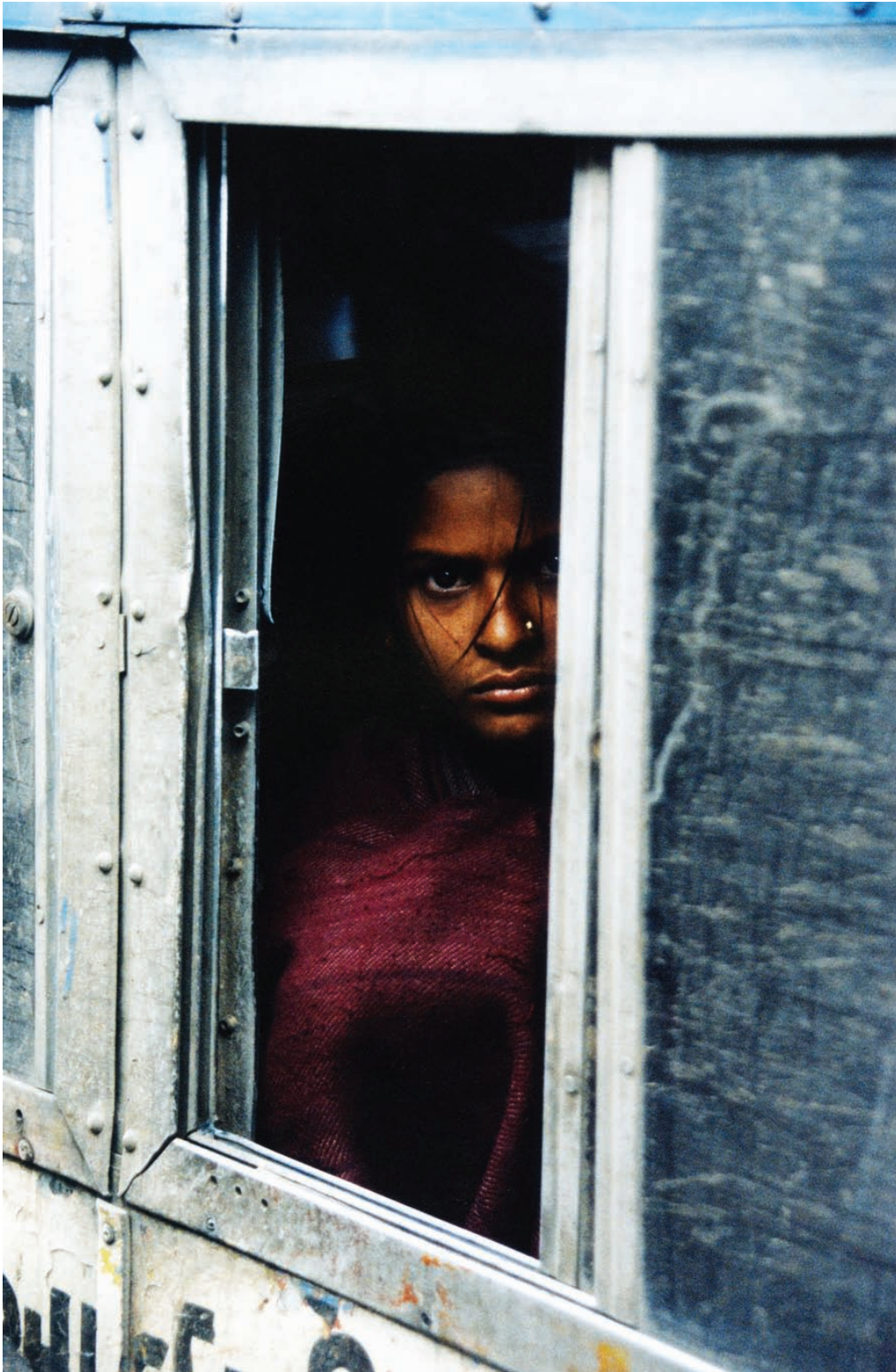
Ahmedabad, India.