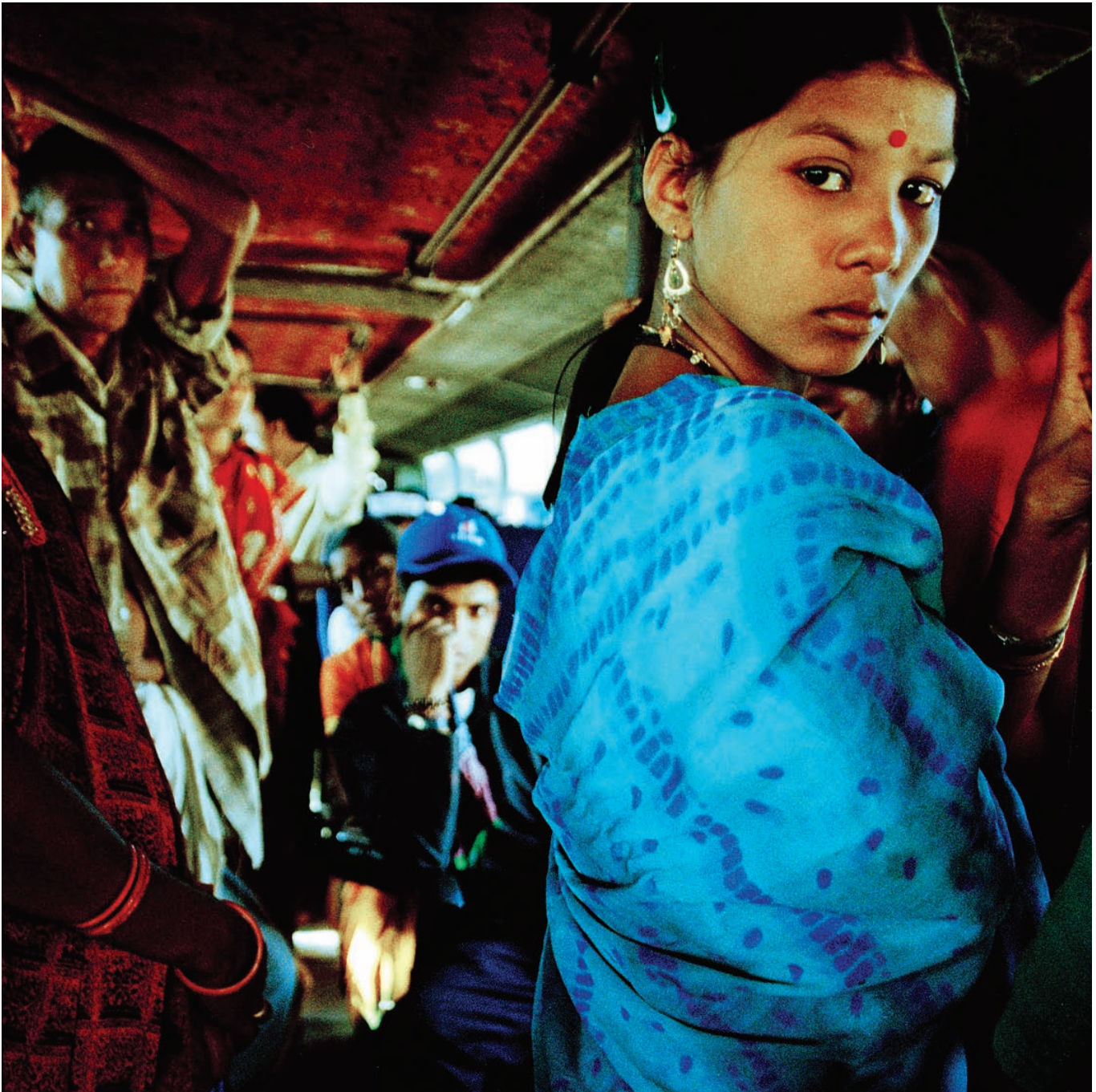
Tikapur, Nepal.