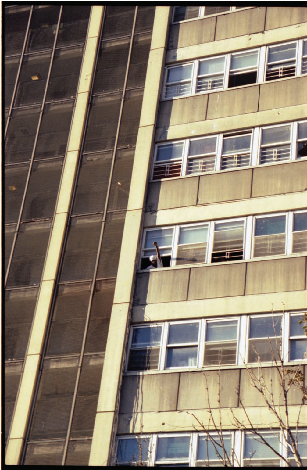
Cabrini Green, Chicago.