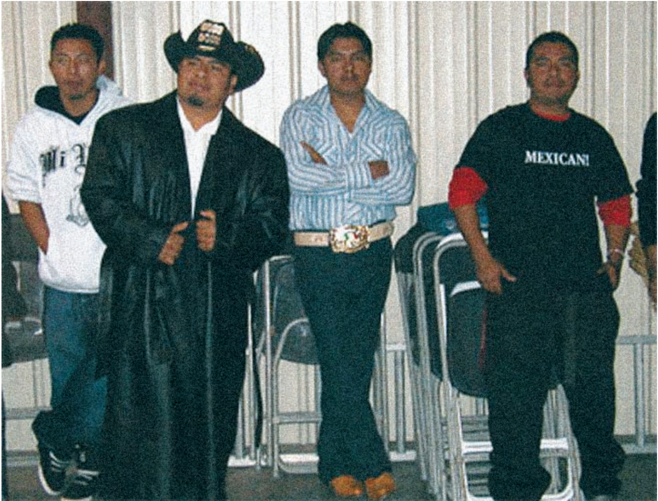
Immigrant workers rally for legal rights with a Catholic mass in county fairgrounds, North Carolina.