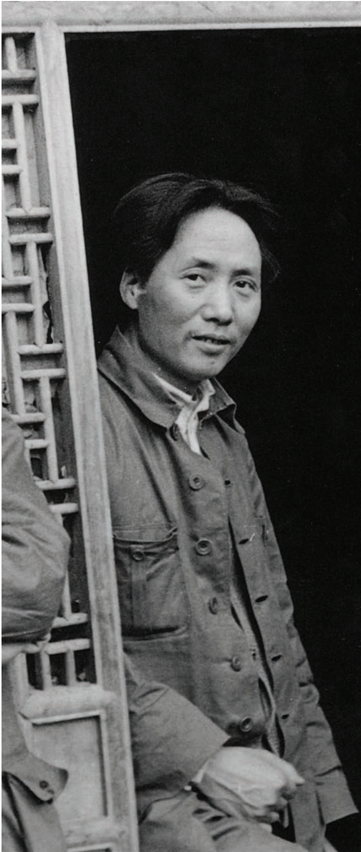
Mao Tsetung, in Yanan base area during the revolution.