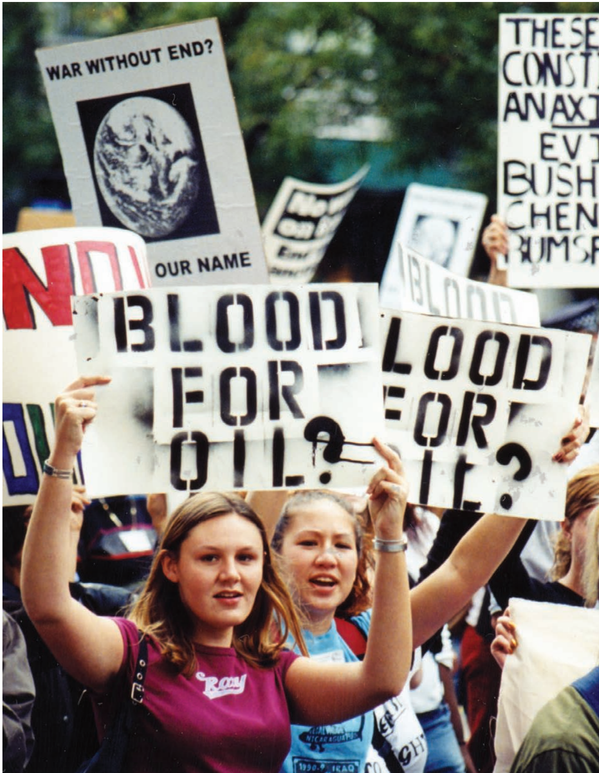
Opposing the Iraq War.