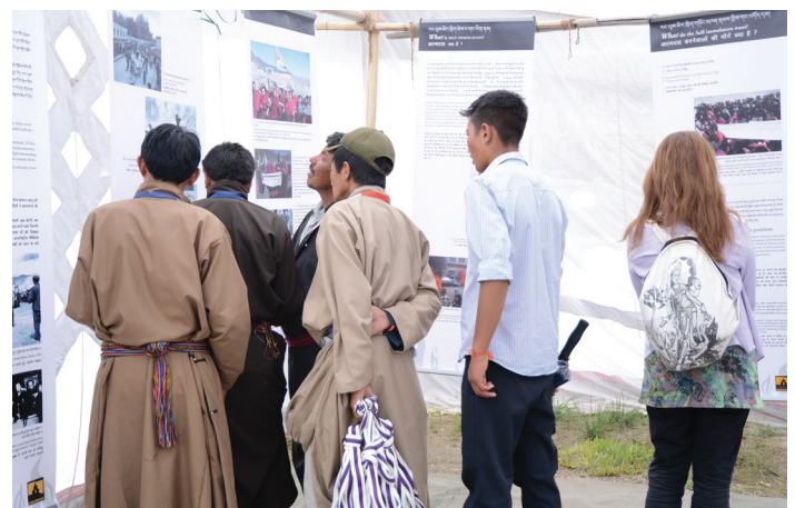
More than 30,000 people from diverse backgrounds visited the Tibet Museum exhibition in Leh, Ladakh