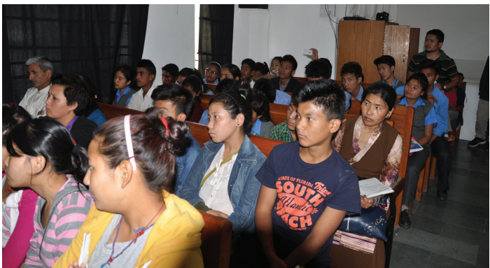
School children at the talk by two former political prisoners