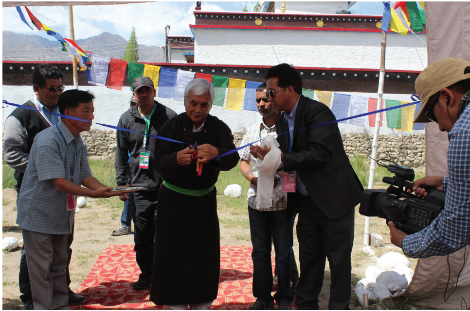
Chief guest Mr. Thupstan Chhewang, Member of Parliament, Ladakh, inaugurating the exhibition