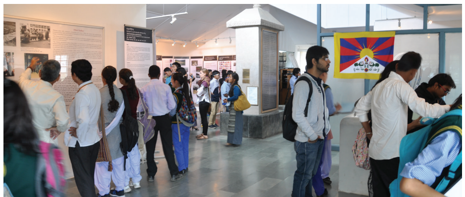
Visitors during the International Museum Day at Tibet Museum

"People have responded enthusiastically to this event. We have witnessed the highest number of people (over 1,400) visiting the museum in a single day till date," Mr. Tashi Phuntsok later told www.tibet.net .