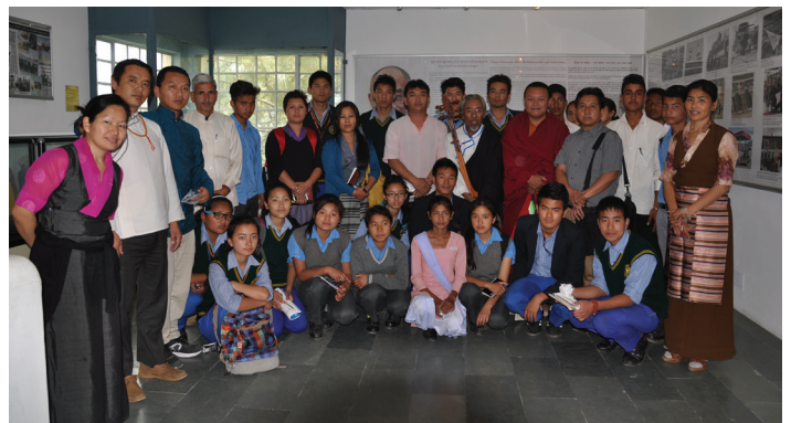
Group photo with school children from schools in Chautra