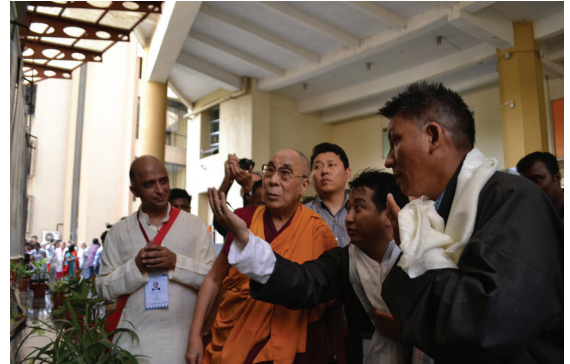
Tashi Phuntsok presenting the photo exhibition to His Holiness the Dalai Lama

Along with the photo exhibitions, the Tibet Museum also screened documentary films on Tibet.