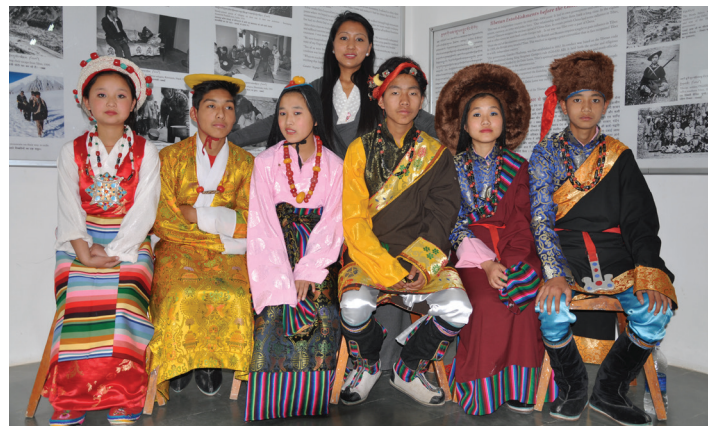
Tibetan school children from Mewon Pateon School showcasing Tibet's traditional dresses