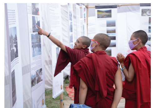
Monks from local monastery visiting the photo exhibition