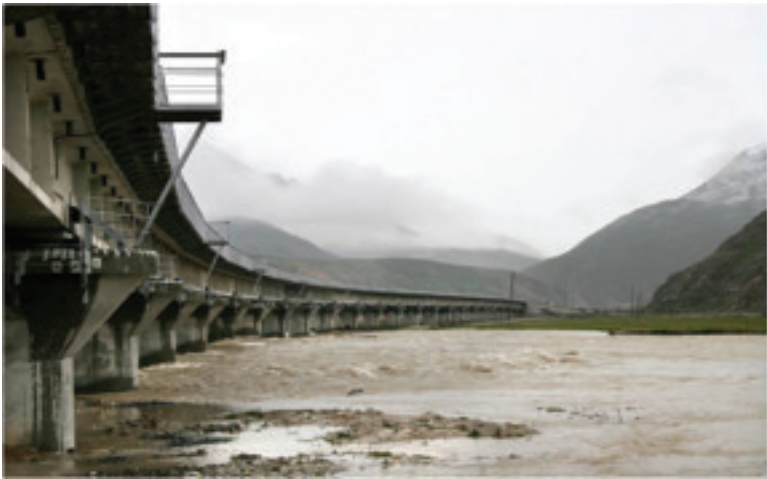
Railway Bridge

On December 31, 2007, the official Chinese news agency Xinhua also reported that the number of tourists that visited Tibet increased by over 60 percent from the previous year, bringing in about 5.5 billion USD in tourism revenues. Xinhua further quoted Zhang Qingli as saying, “The golden era of Tibet tourism has come.” He further added that the rapid increase in tourism and the growth in tourism industry is primarily due to the opening of the railway. The number of visitors to Tibet is expected to hit 5 million in 2008, up 25 percent from a year earlier, and tourism revenue is predicted to reach 6 billion Yuan (826 million USD), up 24 percent. 8 Chinese officials estimate that by 2020, 10 million visitors may come to Tibet. 9