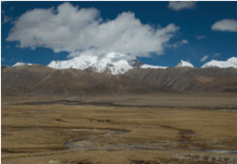
View of degrading grassland through a traveler's lens while experiencing train ride

The grassland ecosystem of the Northern Tibet Plateau (NTP) is the third largest in China. According to a study on the grassland dynamics of the NTP by Chinese researchers Jiahua Zhang and his team, the economic development and increasing population have caused rapid degradation in the grassland ecosystem and decreased the grasslands. 1 Additionally, logging, overgrazing, digging, and sandstorms have also contributed to the “occurrence and expansion of grassland degradation due to acidification and desertification.” 2