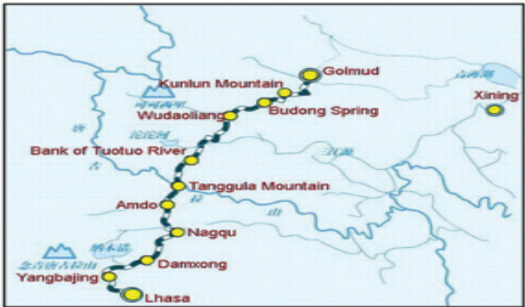
Gormo-Lhasa Railway Route

With the advent of the railroad from Beijing to Lhasa, and therefore a closer and more profound link between China and the formerly sheltered Tibetan Plateau, it has become imperative for the Central Tibetan Administration (CTA) to examine the impacts of the railroad on Tibet's sensitive environment, on its vulnerable culture and people, and the cultural survival thereafter. Given Tibet's history, its remoteness, and its cultural heritage, the railroad has also served as an important tool in understanding the ethnic tensions between the Tibetans and the non-T Tibetans in Tibet, whether the tensions arise because of economic, political or