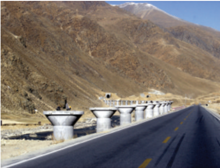
Development or Destruction

The Northern-Tibet Plateau (NTP) covers a vast territory of the western China with an average altitude of 4,500 m. Also known as the roof of the world and the third pole of the earth, it is the source of the ancient and modern glaciers as well as the source of many large rivers in China such as the Yangtze, the Yellow, the Nujiang and the Lancang Rivers [1-3]. The NTP plays an important role as the thermal forcing to the atmospheric circulation in Asia. The thermal state of the NTP links closely to the regional weather and climate condition, such as temperature, precipitation regime, and the status of the monsoon. 1