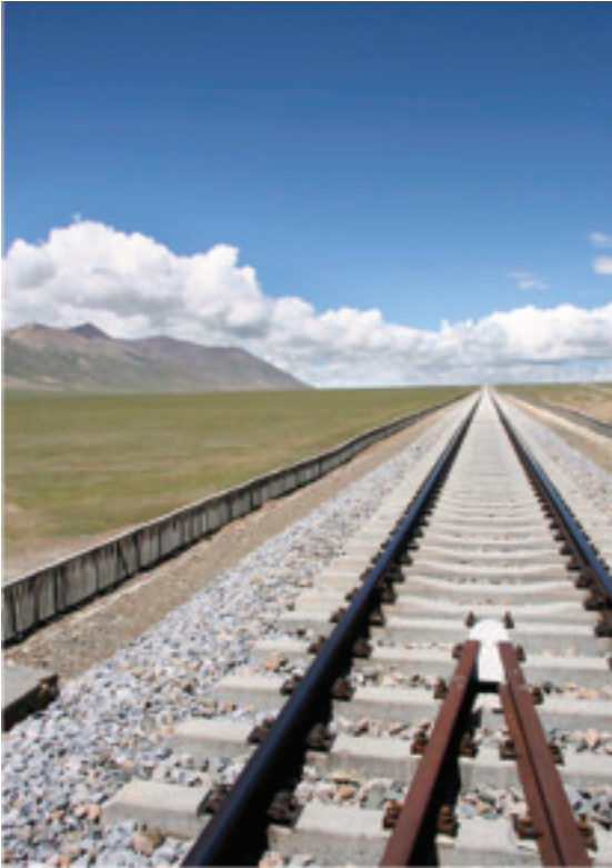
Passing through high terrains

Every day, a total of eight passenger trains and two cargo trains run in both directions on the Siling-Lhasa rail tracks. 10 During the journey to and from Lhasa, the railway passes through “thirty kilometers of tunnels and 286 bridges” 11 to avoid contact with a layer of ice that melts and refreezes almost daily according to the seasons, and also to avoid contact with the unstable permafrost that lies a meter or more below the earth's surface. 12 Of the 1,956kms of track that form the railway, 960kms lie at an altitude of over 4,000 meters above sea level, and 550kms are built on