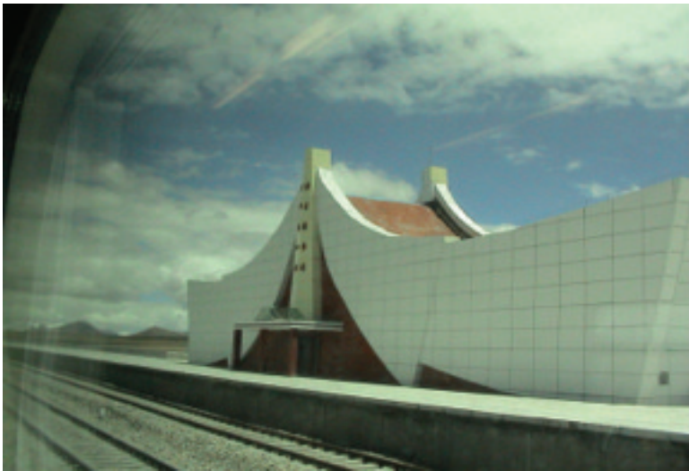
Tanggula the highest station

In 1859, Li Hung Chang, the viceroy of Jiangsu, objected to the construction of the British railway from Suzhou to Shanghai on grounds of foreign encroachment, claiming, “The construction of the railway was deemed to be beneficial to China only when the construction of the railways is undertaken by the Chinese themselves.” 9 Yet today, many ethnic groups including the Tibetans are not consulted with, nor included in the decision making process for large development projects that take place in their surroundings. Such exclusion of ethnic population from policies that affect their lives only creates a rift between the administration and the people, further fueling ethnic tensions in different regions.