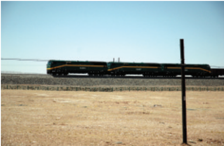
Train to Lhasa

In Tools of Empire: Means of National Salvation Robert Lee writes about China's resistance to colonial railway programs. Fearing that railroads connecting Chinese villages and towns would have a negative impact on Chinese cultural values, destroy employment in traditional transport industries, involve large numbers of "Europeans or Westernized Chinese" working permanently over a large area, and require foreign loans, Shen Baozhen, in the late nineteenth century ordered the demolition of the first railway, as governor general in Nanjing. The railway was only 16kms long and ran from Shanghai to Wusong. 1