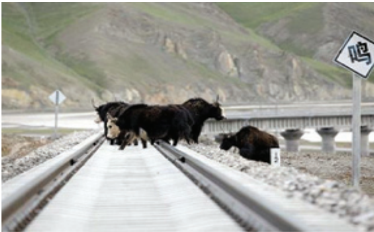
Yak risking their lives on the railway track.

The continuation of the Tibetan Antelope migration, one of the last great ecological marvels on earth, depends on better protection of the species, improved understanding of the ecology and the dynamics of the Tibetan Plateau ecosystem, and innovative approaches to conservation and pastoral development that adopt participatory, integrated ecosystem management models. 1