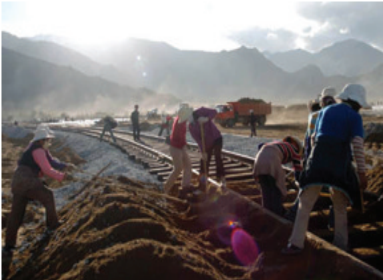
Tibetan workers in the rail road construction in Lhasa

Fischer further notes that each year in the "TAR," Tibetans on average "eat more and more meat, butter and other staples; they have more and more mobile phones, motor bikes, televisions and other durable goods; and they spend more and more money on internet cafes and karaoke bars. Yet it would be surprising if this were not the case given the sheer torrent of subsidies that the