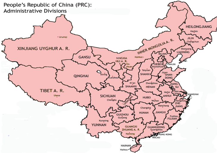
People's Republic of China (PRC): Administrative Divisions