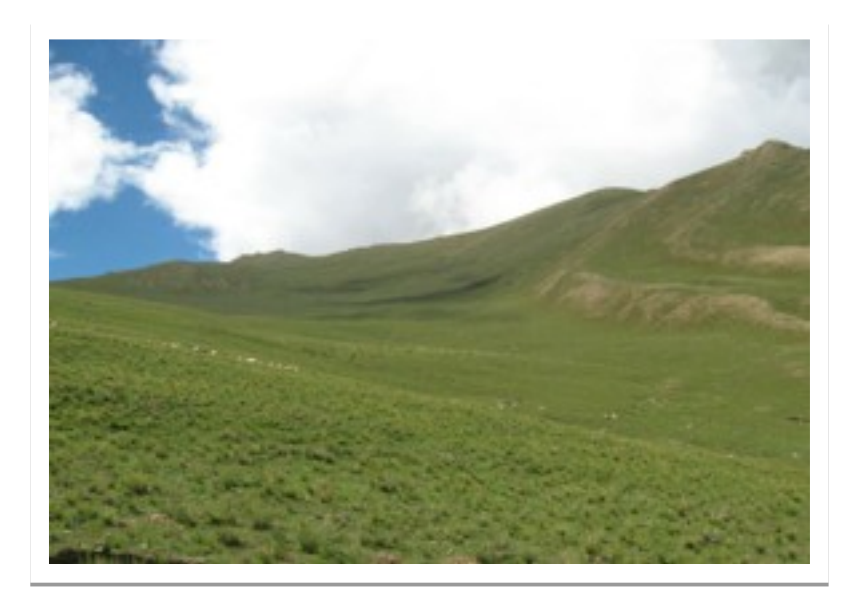
Figure1. Summer pasture

The infinite grasslands and meadows are breathtakingly awesome and serene. In the summer time it would be filled with different varieties of flowering plants and in the winter with a thick blanket of snow. These grasslands not only serve as feeds to the wild ungulates but recent scientific studies have revealed that these grasslands actually store more than 7400 million tons of carbon and grazing herds in turn play an important role in maintaining these grasslands in many ways (Figure1). These grasslands represent one of the last remaining agro-pastoral regions in the world covering the major part of the Tibet's total area.