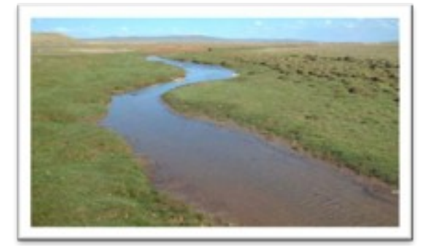
Head region of Machu (Yellow River)