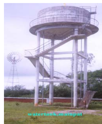
water tank at camp 1, Mainpat

The settlement has a Co-operative Society and it supports the settlers with the supply of seeds, fertilizers and tractor for farming etc. The co-operative Society also assist the farmers in marketing their agriculture product. This Co-operative society is also member of the All India Tibetan Cooperative Federation. Under the management of the Co-operative Societies there are shops, mechanical workshop, tractor section and Handicraft centers to generate income for the co-operative and provide employment by preserving the Tibetan tradition carpet weaving.