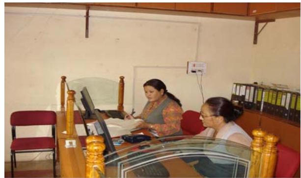
Co-operative Bank staffs on newly purchased computers

Under the coordination of Central Tibetan Relief Committee and Federation of Tibetan Cooperatives in India Ltd. a training on computer & budgeting to Accountants and Assistant Accountants of 15 Tibetan Cooperatives in India was successfully organised. The training was implemented from 8 th - 19 th October 2007 at Lugsam Tibetan Settlement, Bylakuppe by outsourcing resource person. The total cost of the project was Rs. 553,310.00, and it has been funded by AET, France. The training mainly focussed on basic computer application pertaining to accounts and budgeting. The training helps to upgrade the efficiency of the cooperative personnel in computer.