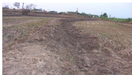
Constructing field contour bunds and trenches at camp 8, Mundgod