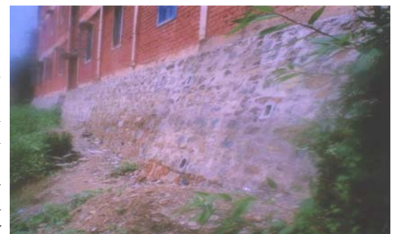
Retaining wall constructed at 'E' Block building, Shimla

Tibetan Welfare Office, Shimla has completed the construction of retaining wall of 'E' Block building and roof renovation of weaver's quarters at Tibetan Handicraft Center, Shimla with kind fund support of Rs. 206,640.00 and 735,579.00 respectively from Polly C. Yau through Tibet Fund, New York.