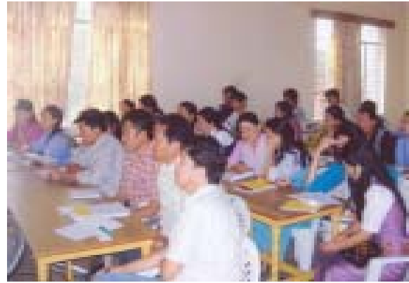
Accountants & Assistant Accountants during the training

Under the coordination of Central Tibetan Relief Committee and Federation of Tibetan Cooperatives in India Ltd. a training on computer & budgeting to Accountants and Assistant Accountants of 15 Tibetan Cooperatives in India was successfully organised. The training was implemented from 8 th - 19 th October 2007 at Lugsam Tibetan Settlement, Bylakuppe by outsourcing resource person. The total cost of the project was Rs. 553,310.00, and it has been funded by AET, France. The training mainly focussed on basic computer application pertaining to accounts and budgeting. The training helps to upgrade the efficiency of the cooperative personnel in computer.