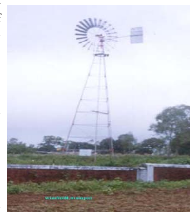
water tower in mainpat

Representative Phendeyling Tibetan Settlement P.O. Kamleshwarpur, District Surguraja Mainpat - 497127, Chatisgarh India Telephone: +91-07834-263211 E-mail: