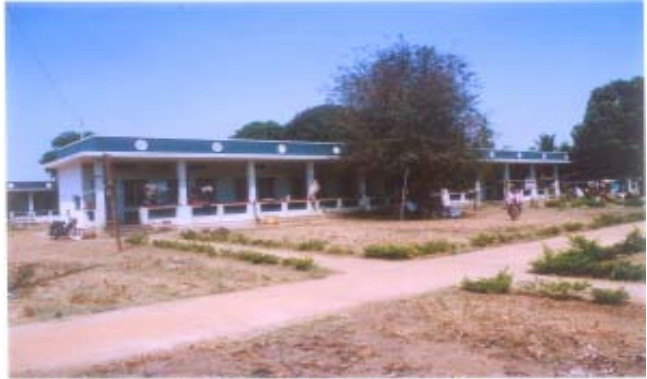
Front view of new block no.2 of Old People's Home, Mundgod

Representative Office Doeguling Tibetan Settlement P.O. Tibetan Colony-581411 Mundgod, Distt. North Kannada Karnataka State, India