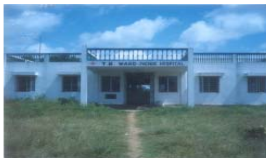
T.B. Ward Phende Hospital of Hunsur settlement

Representative Rabgyaling Tibetan Settlement P.O. Gurupura, Hunsur Taluk Mysore District Karnataka State - 571188 India Telephone: +91-8222-246007/246301 Fax: +91-8222-246007 E-mail: rabling_rap@rediffmail.com