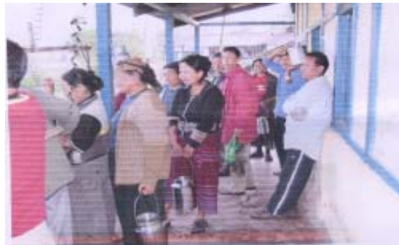
Settlers queue up for providing their milk

The milk collection and sales unit has been set up in Dhargayling Tibetan Settlement, Tezu and it is improving well. Earlier the settlers had faced difficulties in marketing their milk and most of them were sold in Tezu town where the payments were not received in time or otherwise facing various problems. Since the inception of the milk collection center and marketing by Coop. Society, the farmers are now able to get fair price and get their money in time. The milk production in the settlement has increased from 80 lts to 150 lts. per day. This is mainly due to the additional cows that the project has provided to the farmers. The settlement was encouraged to buy local breed cows since they are more resistant to various diseases as well as easy to feed and maintain. Currently the milk supplied by the farmers are marketed to Tezu town. However, the main aim is to produce milk products in the settlement and find markets outside the settlement where the farmers will get better returns. But initially, the settlement farmers need to increase the milk production in the settlement to enable them to have enough milk product for producing milk products like butter and cheese.