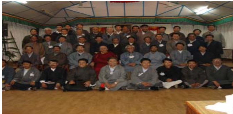
Settlement Officers with Hon. Home Kalon during the meeting

The 5th settlement officers meeting was held from 22nd January to 25th of January 2007 at Dharamsala. All the 39 Tibetan settlement officers from different parts of India, Nepal and Bhutan have attended the 4 days of meeting. The first day of meeting was grace with presence of Hon. Kalon tripa and other 3 Hon. co-kalons of Kashag and it was auspiciously began with the lighting of butter lamp and valuable speeches from Honourable kalon Tripa and other 3 Hon. kalons.