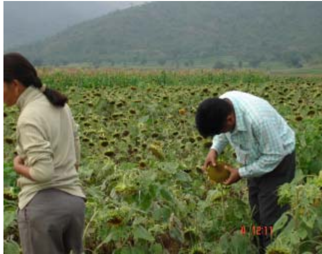
Settlement officer examining the crops with farmers

In addition to this Model Settlement, (CTRC) Home Department has already planned to establish Model camp/Villages in all the Tibetan agriculture settlements as this will create the organic farming awareness and motivate the farmers more easily and faster. Several villages/camps from various settlements have already been selected for Model Village and the work will begin from this year's cropping season.