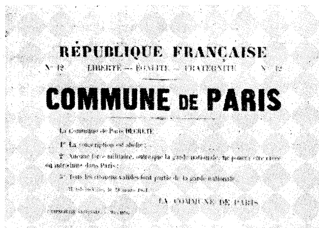
Decree of the Commune on the National Guard

people are not yet complete, or when they themselves are under attack by the revolutionary forces, they frequently resort to a "peace" intrigue to deceive the people. Once they think themselves strong enough to defeat the revolutionary people, they raise their butcher's knife and start a bloody slaughter. These were exactly the dual tactics Thiers used against the Paris Commune.