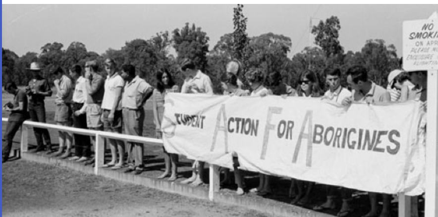
The Freedom Ride through western New South Wales towns in February 1965 drew attention to the racism in these towns.

After covering this information, ask students to complete the questions: ‘Who were the Freedom Riders?’ and ‘Why did the Freedom Riders decide to act?’ on the Freedom Riders Worksheet .