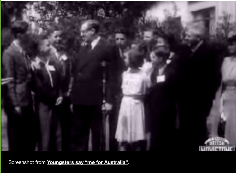
Screenshot from Youngsters say “me for Australia” .

Ask students if they think these young migrants to Australia knew much about the country they were going to.