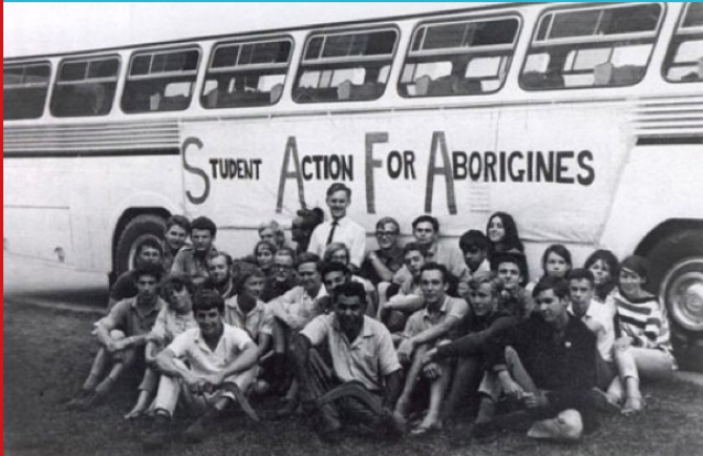
Students involved in the demonstration against discrimination of Aboriginal people in Walgett, NSW.

Students will develop knowledge and understanding about human rights and Australia's responsibilities to its citizens, particularly groups vulnerable to discrimination.