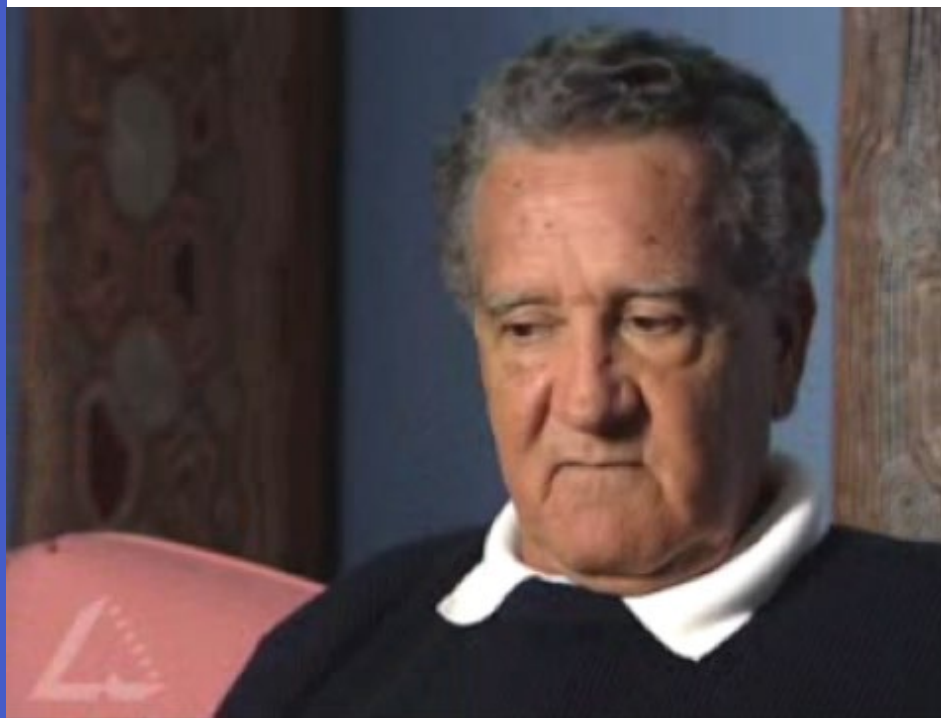
Screenshot from Charles Perkins – Freedom Ride , the National Film and Sound Archives.

After viewing the video, pose the following questions to the class: