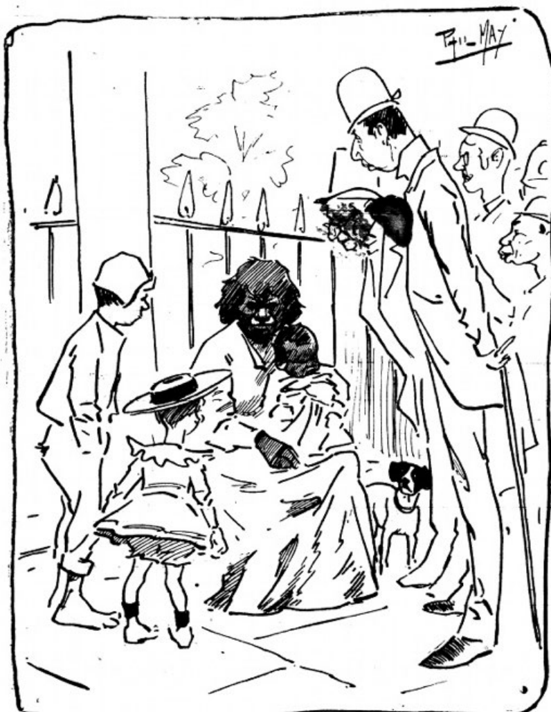
A CURIOSITY IN HER OWN COUNTRY.

Source: Phil May, The Bulletin , 3 March 1888. National Library of Australia.