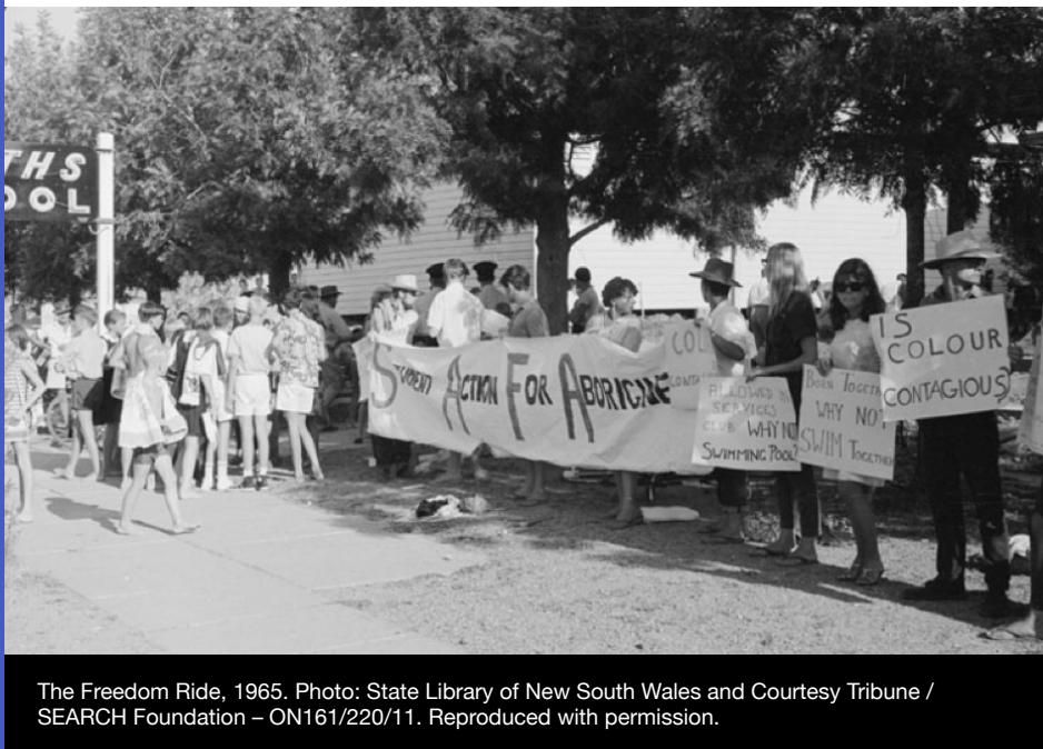
The Freedom Ride, 1965. Photo: State Library of New South Wales and Courtesy Tribune / SEARCH Foundation – ON161/220/11. Reproduced with permission.

Throughout this section ask students to complete to remaining questions on the Freedom Riders Worksheet .