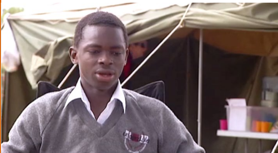
Screenshot from Refugee kids , Behind the News , ABC.

The video provides background information about why refugees come to Australia and the adjustments some young refugees have to make after arriving in Australia.