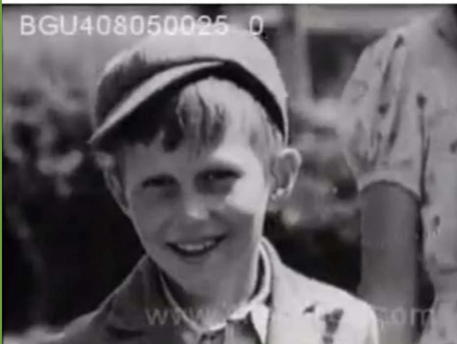
Screenshot from British children evacuate to Australia 1940 .

Have the class view the following short video showing historical footage and record their impressions.