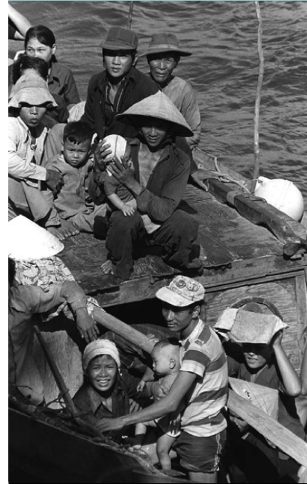
Thirty-five Vietnamese refugees await rescue after spending eight days at sea. Photo by Lieutenant Carl R Begy. Public domain image via Wikimedia Commons.

Vietnamese boat people, Darwin , November 1977, National Library of Australia