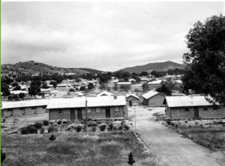
Bonegilla migrant camp , Victoria.

Explain to students that the migrant hostels were established to accommodate the large numbers of migrant arrivals in Australia. They were often set up in former military buildings or camps and often featured very basic facilities. Some migrant hostels were very overcrowded and migrants had to endure poor living conditions.