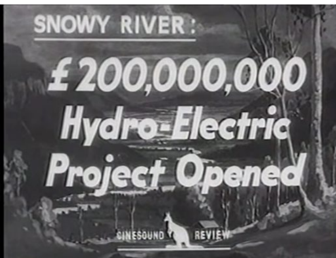
Screenshot from ‘The Snowy’ Part 1 – the Vision , SBS.