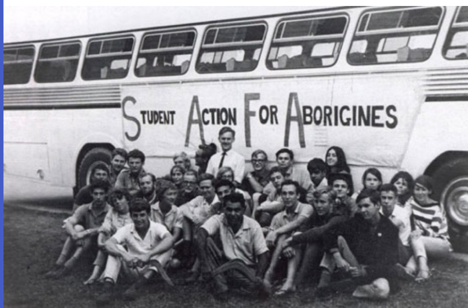
Students involved in the demonstration against discrimination of Aboriginal people in Walgett, NSW.

Show students the following image from 1965 and ask them what information about the freedom riders can be gathered from this primary source (i.e. they were students, they were primarily non-Indigenous Australians).