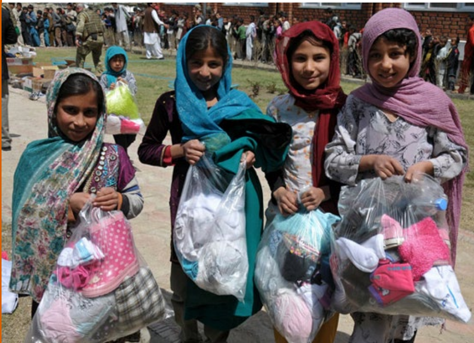
Afghan refugee children.