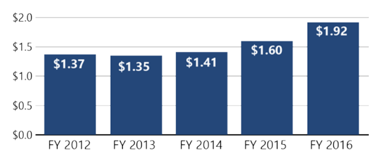
Figure 3: Department of State IT Spending ($ Billions)

Source: Office of Management and Budget, Department of State's Information Technology Agency Summary (September 2016).