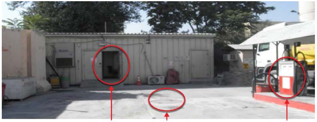
Figure 1: Fueling Station Office at Embassy Kabul

Office door location Bulk underground gasoline fuel storage