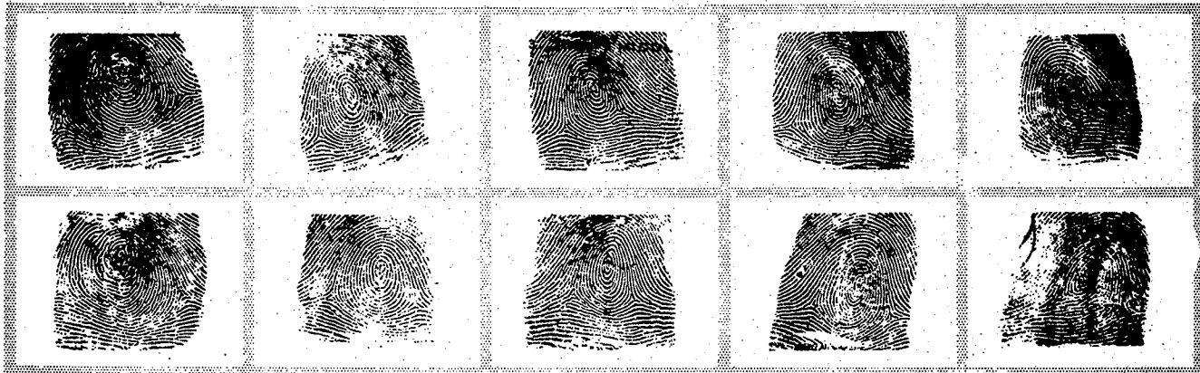
Photographs taken 1970

OTHER NAMES KNOWN BY: Richard M. Nixon, Richard Nixon, "Tricky Dick"