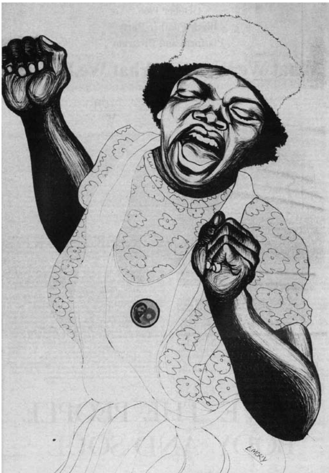
May 29, 1971: Douglas' work shows resilience and hope in the face of oppression.

They often met at a place called the Black House, where Cleaver lived. When Douglas saw Seale typing out a newspaper on legal-sized paper and writing out headlines with a black marker, he offered to help. He went home and grabbed his