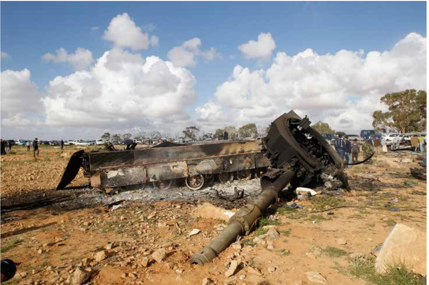
Photo from the Libyan War, which was heavily promoted by Clinton.

nal leadership, but whether America's government has the will. And if it does have the power and the will to lead, the relevant question for the United States is how to do so in a manner that reflects reasonable ambitions as well as necessary limits."