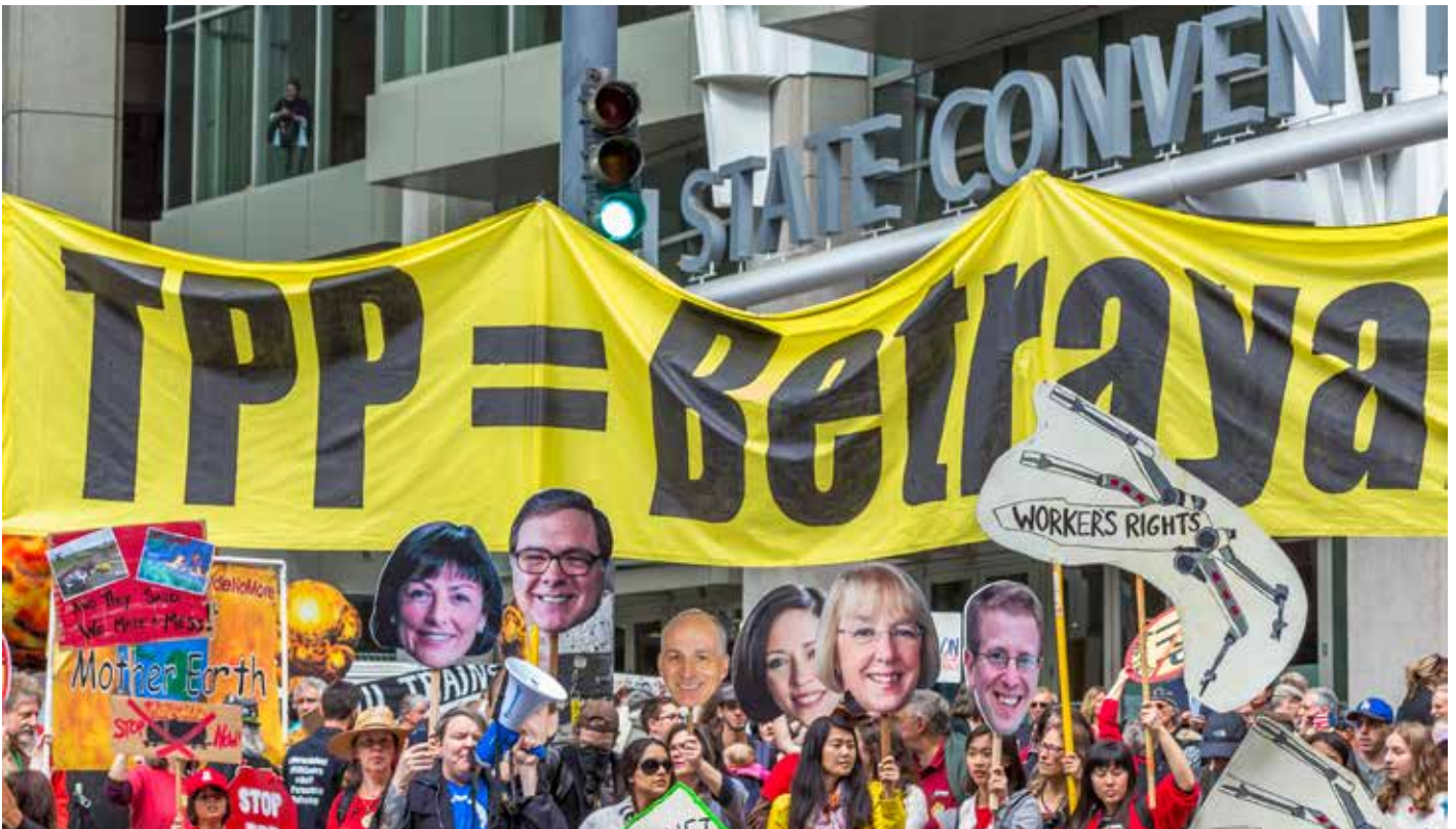
Anti-TPP-Protests.

she selected a major proponent of TPP, Ken Salazar, to head her transition team—a position responsible for making four-thousand presidential appointments. 76 HRC's nod to Salazar supports the notion that her stance against the deal is nothing more than a strategic ploy to sustain more voters in order to win the election. If elected president, there will be no shock when she reopens TPP negotiations, claims to have rid the agreement of its flaws, and pushes it onto Congress for ratification.