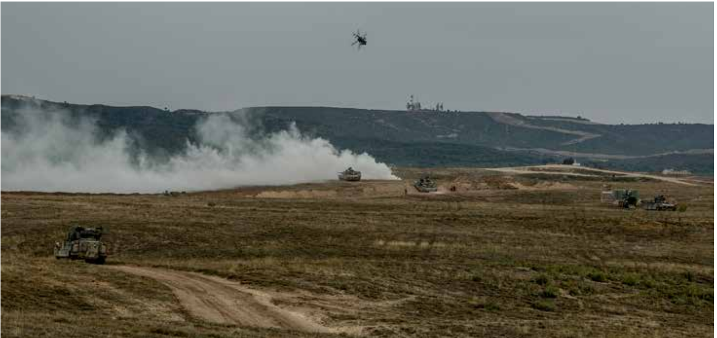
NATO-Exercise Trident Juncture 2015.

Soviet Bloc and the former Warsaw Pact states. NATO went through considerable reformation as its existence as a balancing, deterrent force could no longer be justified against a seriously injured Russia during the 1990s. With so many institutions and jobs tied to NATO and a lingering sense of adversity towards Russia, the alliance's leadership did what was necessary to stay in demand, namely, changing its role—at least officially—to one of maintaining Western interests through the spread of democracy and stability. 43 In stark contrast to these ideals, NATO has proved itself to be a vessel of regime change and instability as is evident in Yugoslavia, Afghanistan, and Libya. Moreover, it has been encroaching on Russia as it swooped up new members from former Soviet Bloc states. Compounded with the European Union's recruitment of Eastern European states into their economic alliance, Russia has been put in an uncomfortable position to say the least.