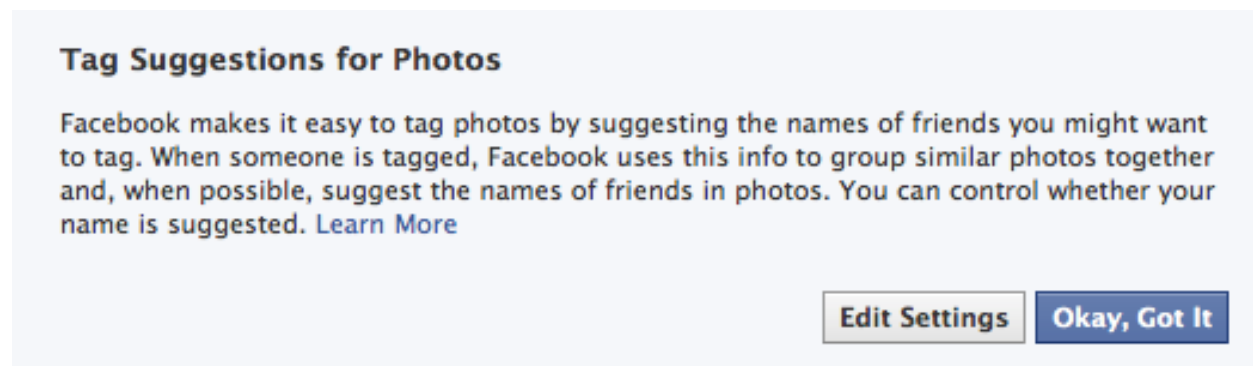
FIGURE 2: Facebook notice for facial recognition tagging technology (January 27, 2012).

photo uploading system and entirely fails at informing users how their photo data will be used or to provide any meaningful consent for use..