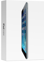
Retail packaging for iPad mini 2 uses a minimum of 38 percent post-consumer recycled content.