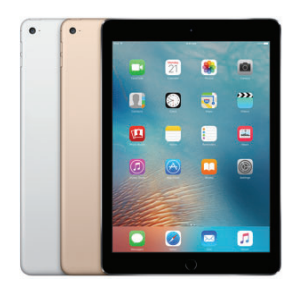
Date introduced October 16, 2014