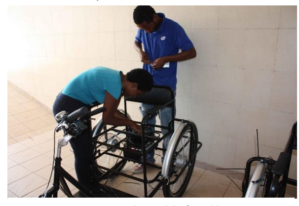
Young creators preparing the eco-bike for public presentation

The "Eco-friendly Mobility" project financed by GEF/SGP-PNUD, aims at building a future without dependence on fossil fuel, using new technologies such as electric mobility and 100% renewable charging