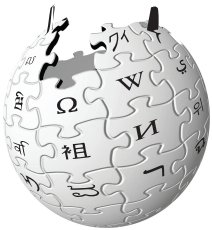
WIKIPEDIA The Free Encyclopedia

Your support allows us to continue empowering world citizens to share in the sum of all human knowledge.