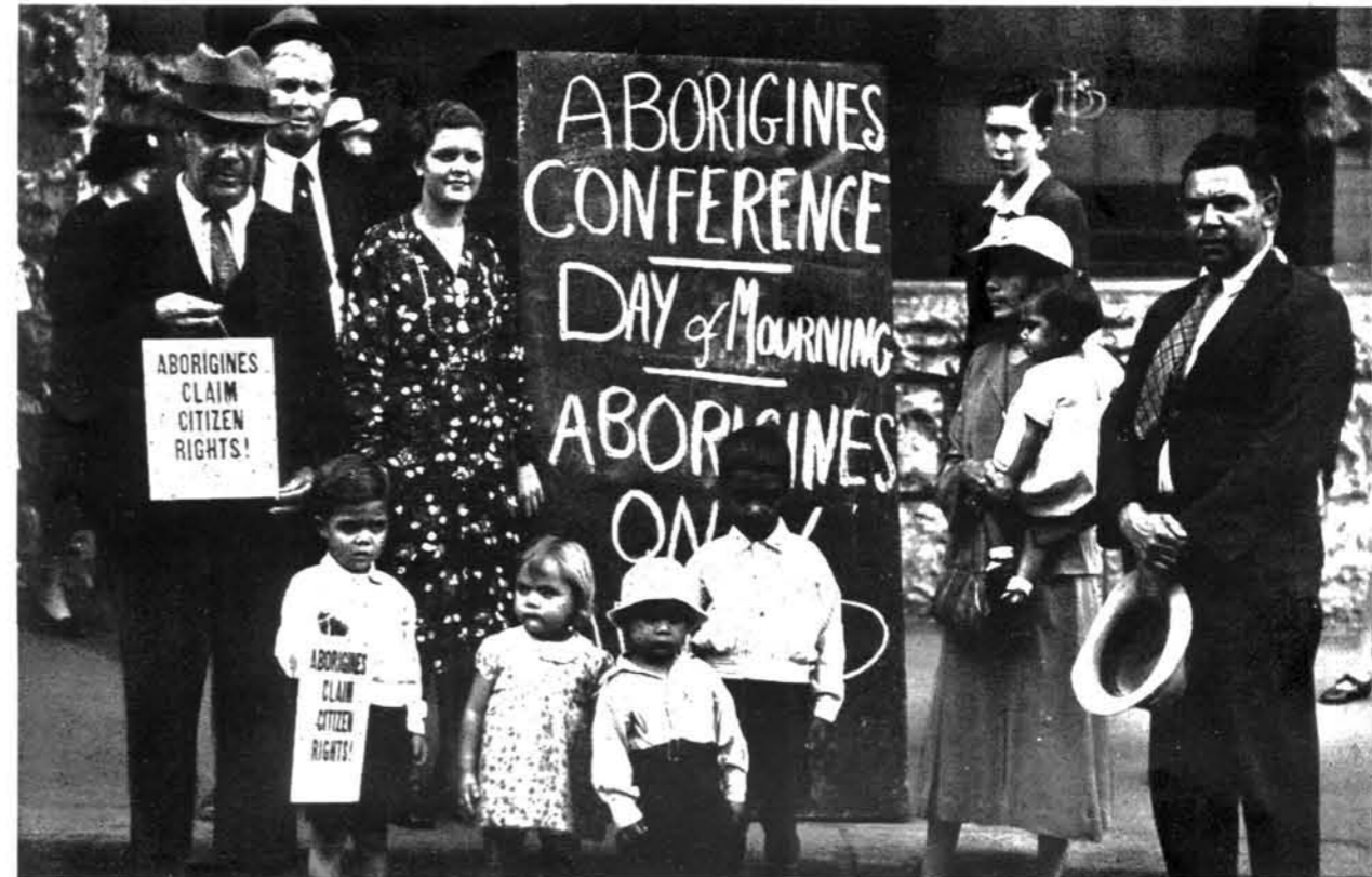
A LARGE BLACKBOARD displayed outside the hall proclaims, "Day of Mourning." Leaflets warned that, "Aborigines and persons of Aboriginal blood only are invited to attend." At 5 o'clock in the afternoon resolution of indignation, protest, was moved, passed.