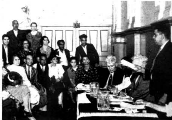
SECTION OF ABORIGINAL MEETING in Australian Hall, Sydney, organised by Aborigines' Progressive Association mourners.