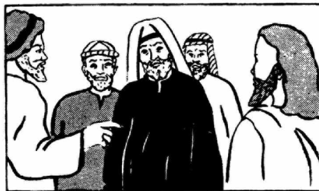
Jesus rebuked the scribes. "Tell Me, is it easier to say to this sick man, 'Your sins are forgiven you' or 'Take up your bed and walk'?" They could not answer a word. Jesus said, "I want you to know that the Son of Man has power on earth to forgive sins."