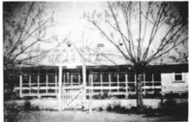
This is Walgett Aboriginal School