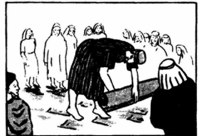
Therefore He said, "Arise, take up your bed and go home." The man at once did as Jesus told him and walked away, carrying his bed. The amazed crowd glorified God, saying, "We never saw such a wonderful thing before!"