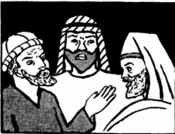
"Who can forgive sins but God only!" murmured the scribes, who heard Christ say, "Son, thy sins be forgiven thee." "Listen to this Man speaking blasphemy!" they said in a way which questioned Jesus' authority.