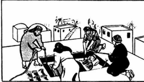
They found Jesus in a house full of people. "What shall we do?" they asked one another hopelessly. "If we take him back home, he will die!" One suggested, "I know what we will do. Let us break the roof of the house and let him down." They began to do this.