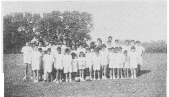
Some of Cabbage Tree Island school children who participated in the recent inter-school sports