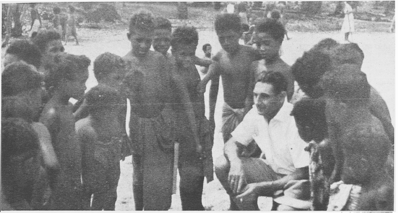
The cameraman had to go a long way to get this photo, thousands of miles away to New Guinea, as a matter of fact. And as you see, he found the Editor of Dawn surrounded by a group of young Papuan friends