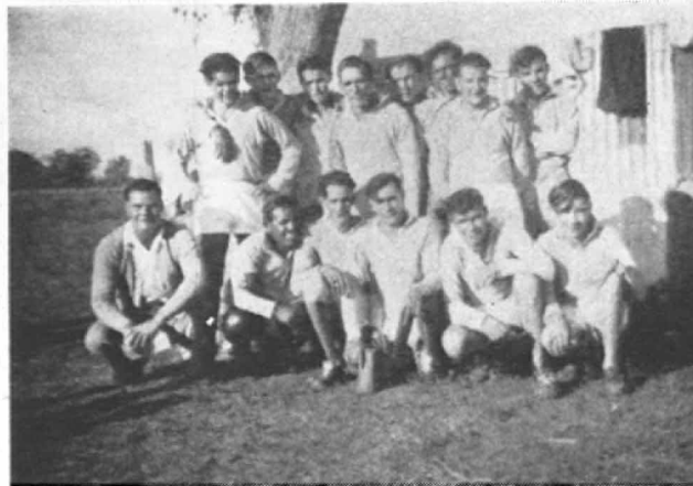
Popularly known as the "Rats", the Caroono B team has played excellent allround football this season