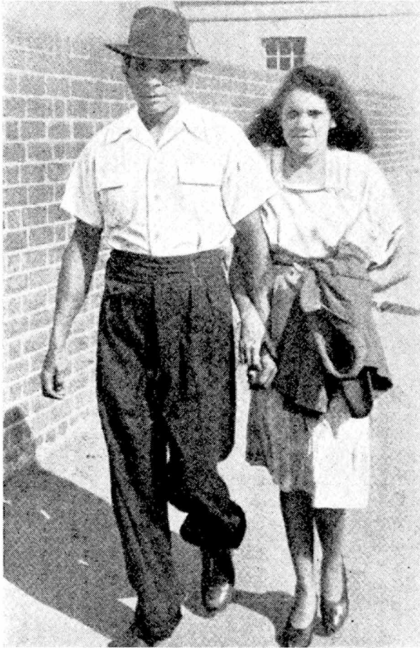
A young couple from La Perouse set out to do a day's shopping in the city.

If you have photos at home, similar to those you see published in Dawn , send them along and thus add to, and maintain, the interest in your fellow men and women.