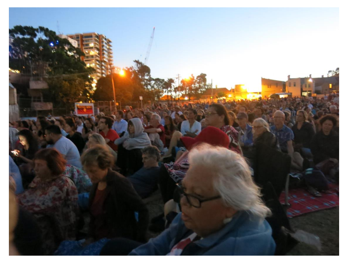
4000 people attended the Australian premiere of Utopia in Redfern, Sydney

This was dramatically demonstrated at Utopia's premiere in Redfern, Sydney, where 4,000 people filled the equivalent of two football pitches to watch the film on a large screen. "I had never imagined this in my own country," said Pilger. "People journeyed thousands of miles from all over Australia. Some spoke their language for the first time at a public event in an Australian city. Indigenous and non-Indigenous Australians stood together in tribute when the film ended."