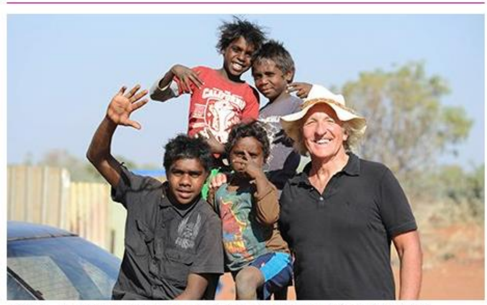
Utopia ... 'I guess Australia isn't ready to confront some parts of its history.'