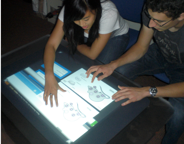
Figure 2: G-nome Surfer comparing gene ontology and expression data of different mouse genes.

provide empirical evidence for the feasibility and value of integrating reality-based creativity support environments in college-level science education as well as shed light on how users collaborate and solve problems using such environments in the context of college level inquiry-based learning [13].