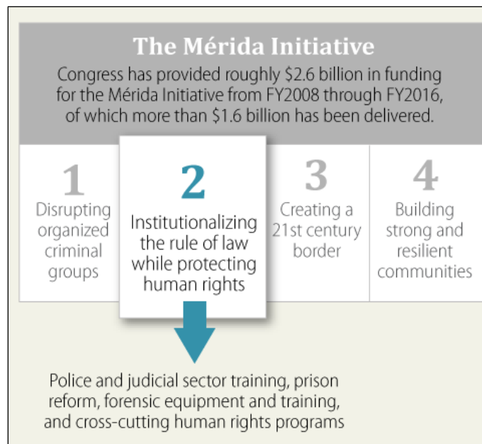
Figure 3. Four Pillars of the Mérida Initiative

Graphic prepared by CRS Graphics.