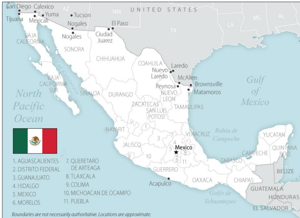
Figure 2. Political Map of Mexico