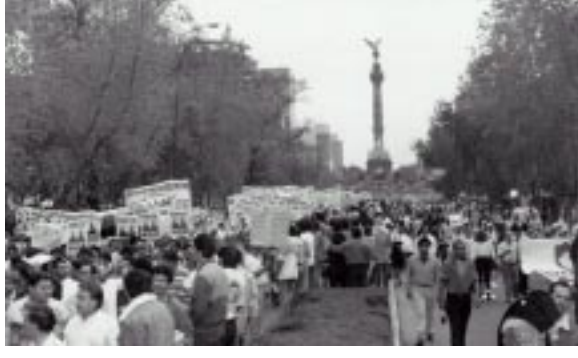
National AutonomousUniversity of Mexico student strike