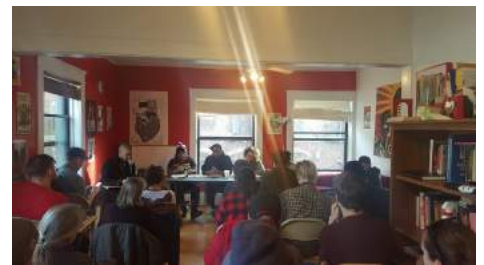
From Left to Right: Meeting at IWW office responding to police shooting; GDC Picket Training participants (2015); IWW Work Peoples College panel on the 4th Precinct protests

I'm not certain that we currently have the practices and culture in place to maintain this without serious new effort. The rapid growth in membership proposes a challenge to this: it means that the serious and lengthy process of mutual education, which was the basis of our common understandings and analysis, and made our planning and actions easier and more coherent, will now have to be sped up and transformed into a process that can handle large numbers of new members.