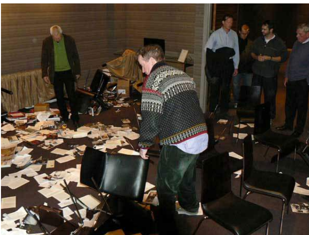
Aftermath of 2012 antifa disruption of Holocaust-denier David Irving's event in Minneapolis, MN

Partly that was organic, because of the people involved. One of our members was a member of the Baldies, and later Anti-Racist Action, and brought a lot of experience on that front to the table. 3 Others also had anti-fascist experience. Given that density of experience and expertise, it was fairly natural that we were interested in anti-fascism from the beginning.