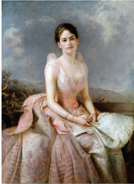
Gift of the Girl Scouts of the United States of America

Visit five Smithsonian museums to celebrate 100 years of Girl Scouting!