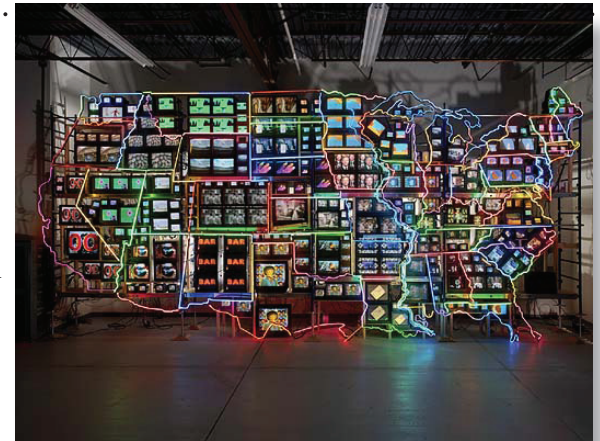
Gift of the artist ©1995, Nam June Paik

Electronic Superhighway: Continental U.S., Alaska, Hawaii by Nam June Paik, 1997 ▶ Smithsonian American Art Museum, Lincoln Gallery, 3rd Floor — Originally from Korea, Nam June Paik created Electronic Superhighway to honor his adopted homeland. Paik chose videos to represent his impression of each state. ▶ How did Paik represent your state? How would you express what it means to be an American to someone newly arrived in this country?