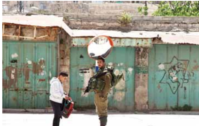
▲ Israeli soldier searches boy's school bag in Hebron.

Settlements are Israeli communities established on territory occupied by Israel since the 1967 Arab-Israeli war. Settlements are supported by an infrastructure including special roads, checkpoints, and the separation barrier dividing them from the surrounding Palestinian population. Settlements violate international law and UN Security Council resolutions and yet, throughout the 45 years of Israel's occupation of the Palestinian territory, every Israeli government has promoted continued settlement expansion.