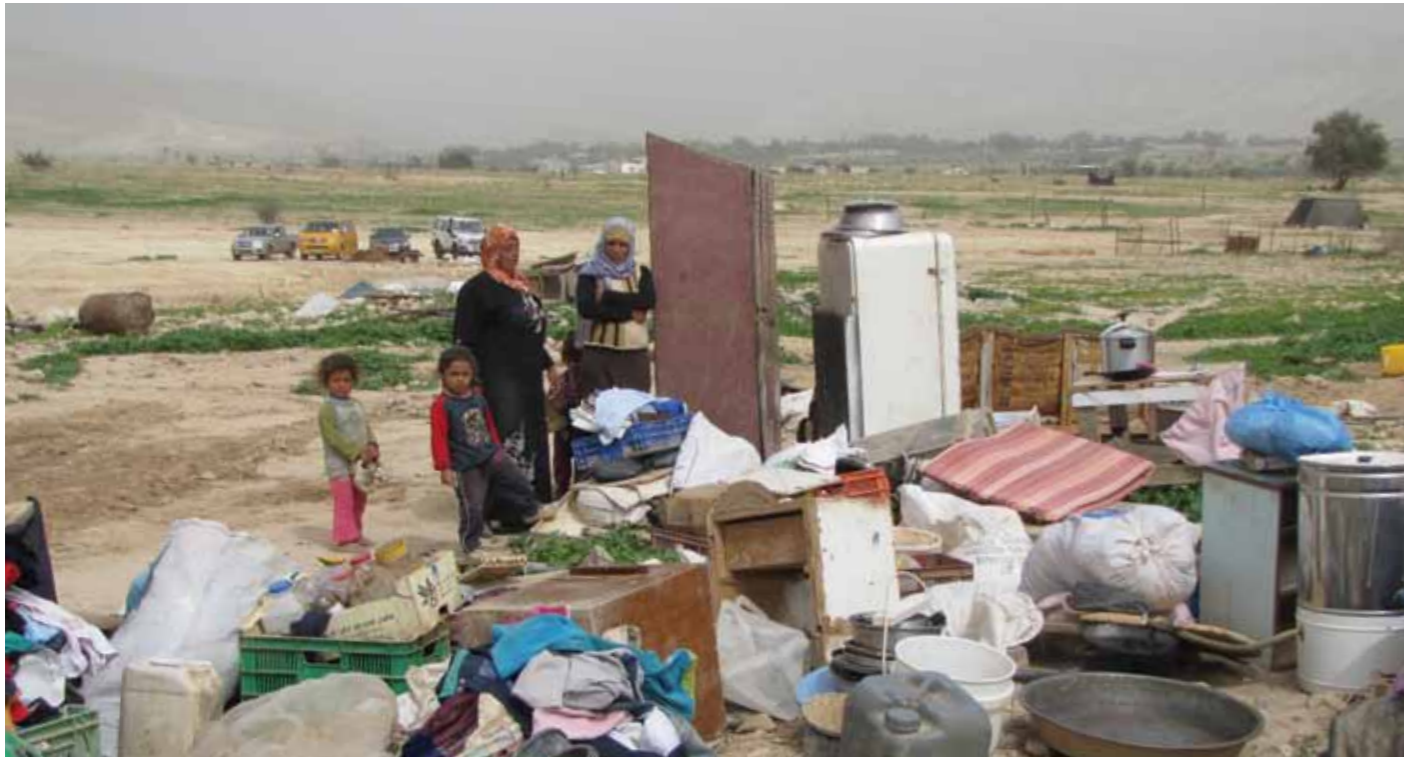
▲▲ Members of the a-Rashaydah family after the demolition of their home in Fasayil, the Jordan Valley.

The Israeli policy of building settlements in the occupied territory results in widespread human rights violations and undermines the development of Palestinian communities. Palestinian homes are demolished to make way for illegal settlements, displacing hundreds of people every year. Settlements deny Palestinians freedom of movement and deprive them from accessing vital resources such as water and farmland.