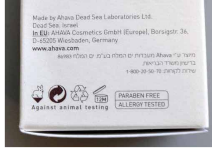
▲ The company Ahava labels their products “Made in Israel”, despite the fact that they are manufactured in a settlement in the occupied Palestinian territory. The postal Code 86983, shown in tiny characters on the packaging, is the postal code for the Israeli settlement Mitzpe Shalem by the Dead Sea.