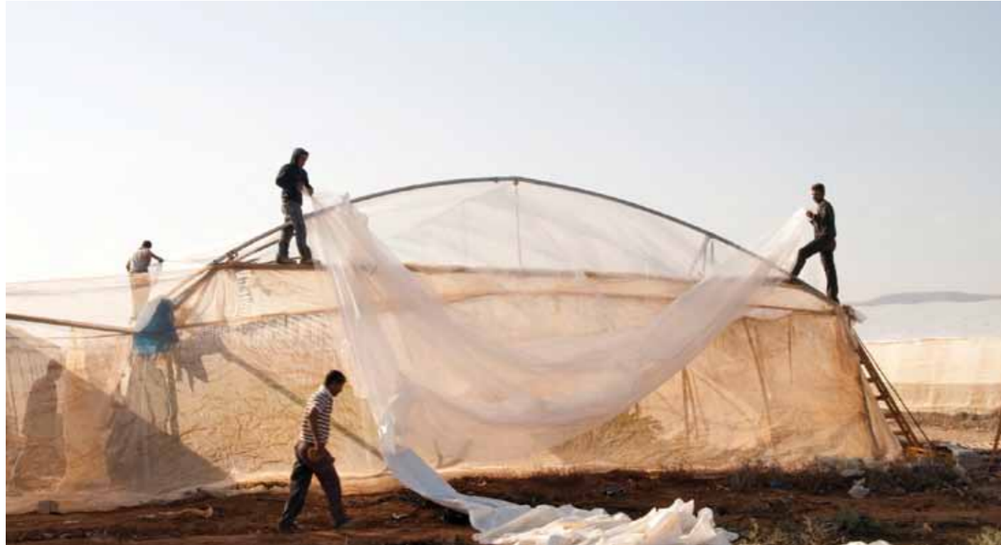
▲ Palestinians construct a greenhouse on an Israeli settlement farm in the Jordan Valley.

Water cisterns used by Palestinian farmers to collect rainwater are frequently demolished by the Israeli authorities (46 in 2011 alone), further limiting their ability to grow crops. 43 In addition, a growing number of water springs on Palestinian land in the vicinity of settlements have been taken over in recent years by settlers who have subsequently blocked Palestinian access to them. 44