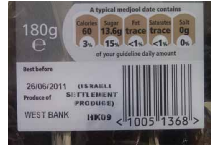
▲ Dates on sale in the UK. In accordance with the labelling guidelines introduced by the UK government in 2009, the label clearly states that it is “Israeli settlement produce”.

Danish FM Villy Søvndal announcing labeling guidelines. 147