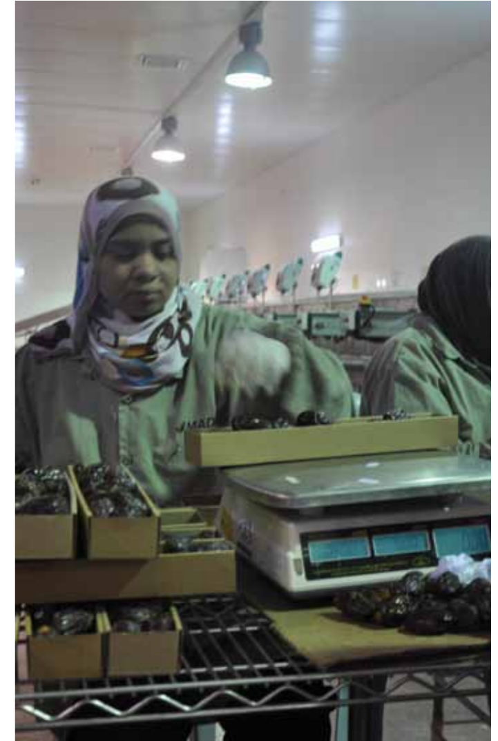
▲ Workers sort dates for export at Nakheel Palestine for Agricultural Investment.

With the goal of providing a solid alternative to employment on settlement farms, Nakheel Palestine currently employs 40 full time and 100 seasonal workers. With plans to plant an additional 24,000 date trees in the next two years, Al-Manasreh expects to triple its workforce.