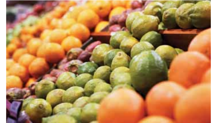
▲ Citrus fruits being sold in a supermarket.

Apart from fresh produce, a number of Israeli wines sold in Europe are made from grapes grown in settlements. According to the Israeli NGO Who Profits, all of the major Israeli wineries exporting to Europe have vineyards in the occupied Golan Heights and most in the West Bank. 106 Food processing companies based in the West Bank settlements and exporting to Europe include Achdut (producer of Achva halva) and Adanim Tea (herbal teas). 107