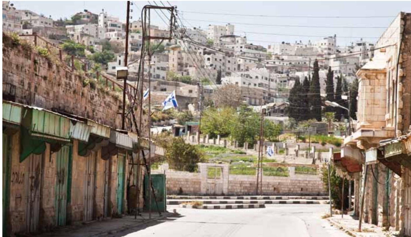
▲ Some streets in the old centre of Hebron are now off limits to Palestinians due to the presence of settlers in the centre of the city. Streets such as this were once busy markets but are now empty.