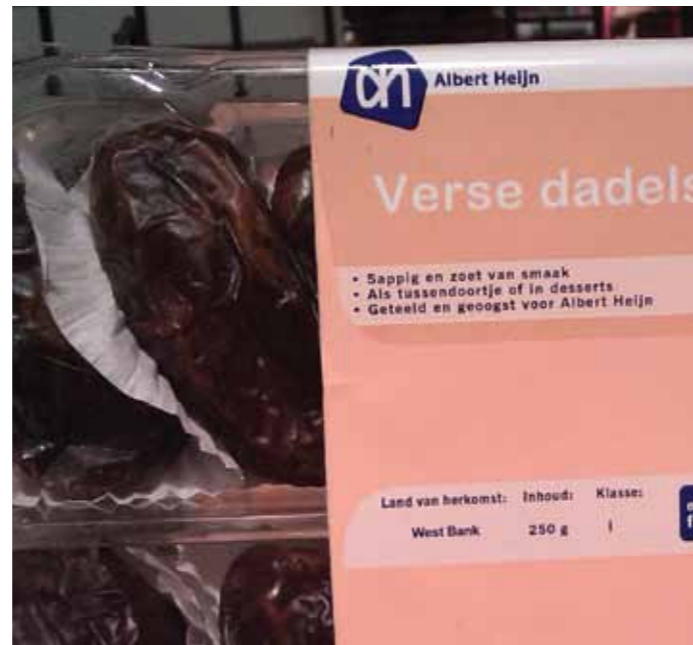
▲ Dates on sale in the Netherlands. The label reads "West Bank" which leaves the consumer unclear whether the fruits are from Israeli settlements or from Palestinian producers. After enquiry, the seller explained the dates were from Tomer settlement in the Jordan Valley.

The main Israeli exporter of dates is the company Hadiklaim. Hadiklaim appears to mark all dates as Israeli produce, making it difficult for the consumer to distinguish between dates from Israel proper and from the occupied Jordan Valley.