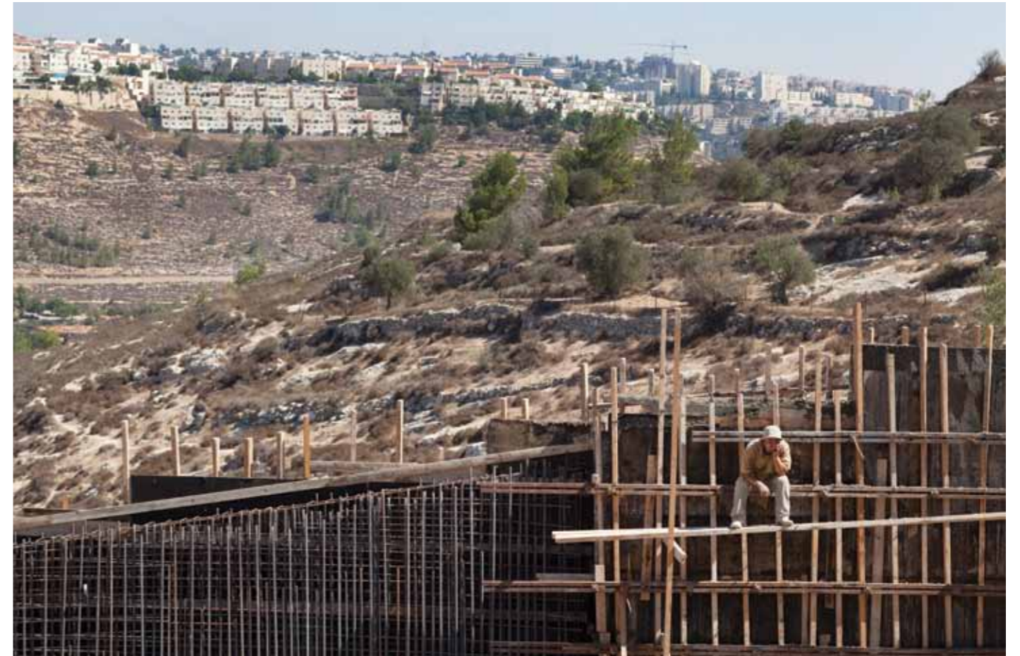
▲ The construction of the Wall in the Palestinian village of Al Walaje which has been surrounded by thousands of settlement units in the Gush Etzion bloc.

Through the establishment of settlements, Israel has created a discriminatory two-tier regime in the West Bank with two populations living separately in the same territory under two different systems of law. While settlers enjoy all the rights and benefits of Israeli citizens, Palestinians are subject to a system of Israeli military laws that deprives them of their fundamental rights. 17