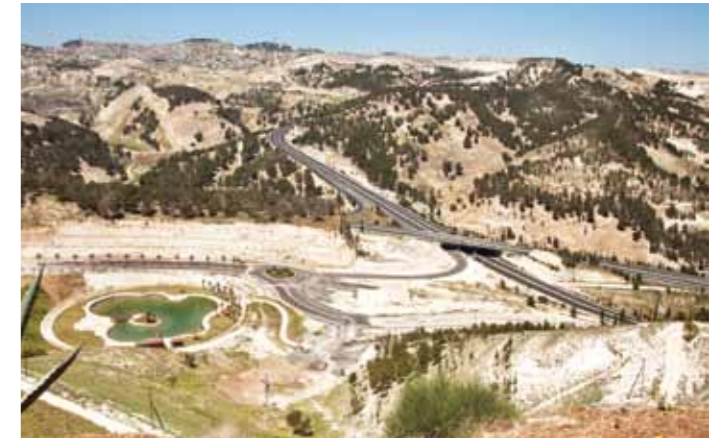
▲ An Israeli settlement on the outskirts of East Jerusalem. Settlements are being constructed around the city, cutting off Palestinian East Jerusalem from the West Bank. Despite widespread water shortages in Palestinian communities, many of these settlements boast swimming pools and water features.

Access to East Jerusalem also remains a major problem. Israel obliges any Palestinian who does not have residency rights in Jerusalem or Israeli citizenship to apply for a permit through a complicated and time-consuming process. This is also the case for medical patients accessing Palestinian hospitals in East Jerusalem. 19% of patients and their companions in the West Bank who applied for healthcare access in 2011 had their permits denied or delayed. 33 In a vast majority of ambulance transfers, patients must be moved from a Palestinian ambulance to an Israeli ambulance at a checkpoint before entering Jerusalem. 34