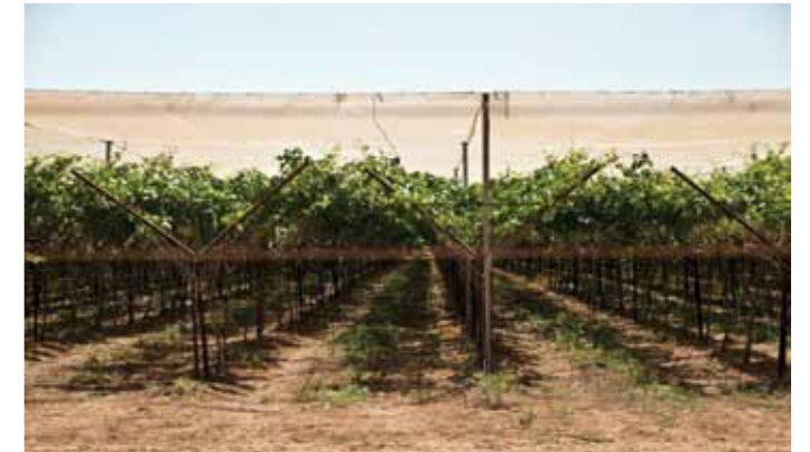
▲ Vineyards that form part of an illegal Israeli settlement in the Jordan Valley in the West Bank, built on confiscated Palestinian land.

Settlements have established modern agribusinesses and industrial zones that produce high value goods for export to the EU and international markets. This is partly due to the special incentives provided by the Israeli government.