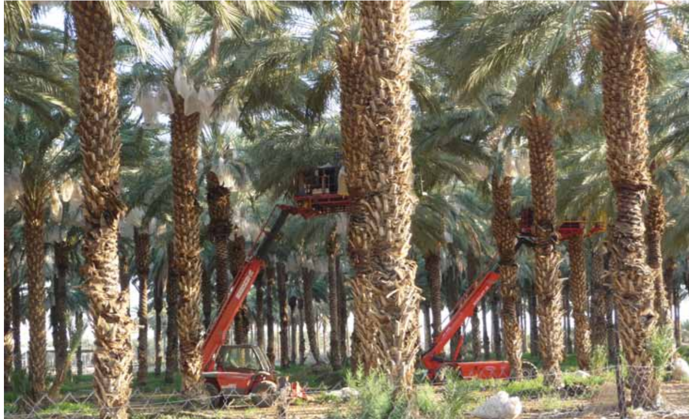
▲ Palestinians harvesting dates in Tomer settlement, Jordan Valley.