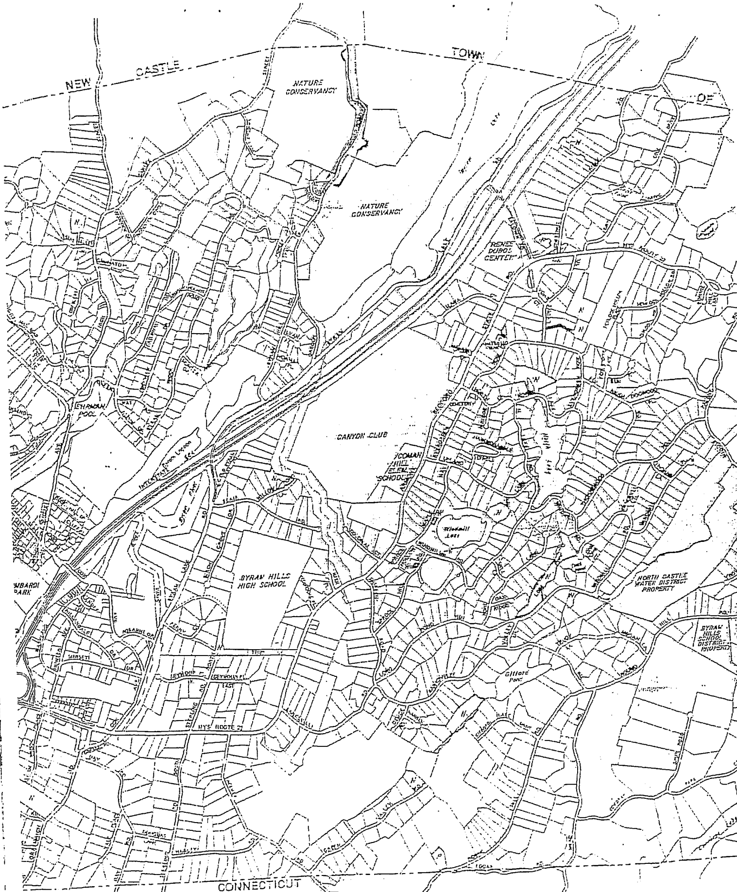
Portion of official Map of the Town of North Castle adopted by the Town Board on October 23, 1997