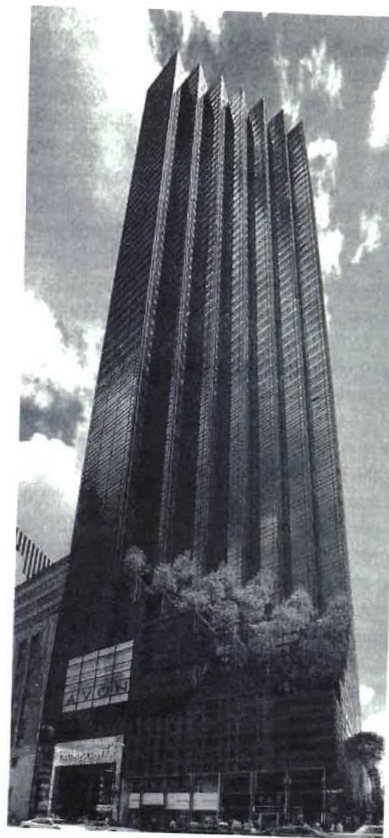
Trump Tower on 5th Avenue