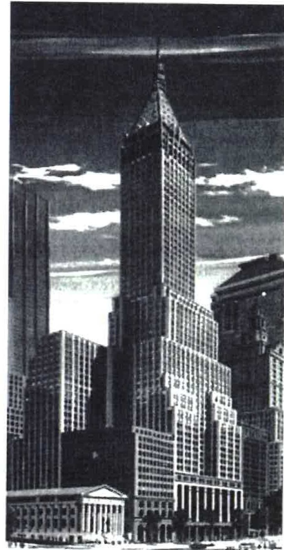
40 Wall Street