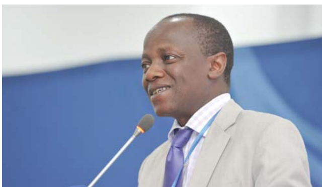
Mr. Collins Chabane: former Minister in the Presidency, currently Minister of Public Service and Administration

achieved in the last century in drafting policies, frameworks, charters, protocols and legal instruments aimed at protecting and promoting gender rights but more needs to be done in order to ensure that policies, declarations, and legal instruments are adequately effected.