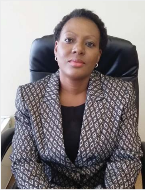
By: Keketso Maema

Section 187(1) of the Constitution of South Africa reads: "The Commission for Gender Equality (CGE) must promote respect for gender equality and the protection, development and attainment of gender equality." The CGE is a catalyst for the attainment of gender equality. Section 187(2) grants the CGE "the power, as regulated by national legislation, necessary to perform its functions, including the power to monitor, investigate, research, educate, lobby, advise and report on issues concerning gender equality."