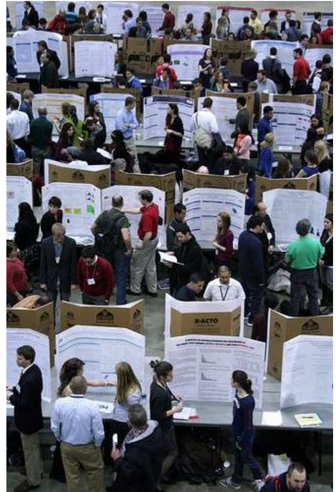
Mathematical Association of America