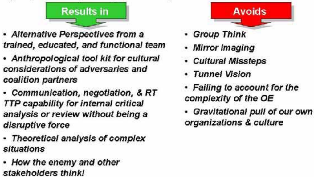
Figure 1. UFMCS Definition of Red Teaming

A function that provides commanders an independent capability to fully explore alternatives in plans, operations, concepts, organizations, and capabilities in the context of the operational environment and from the perspectives of partners, adversaries, and others.