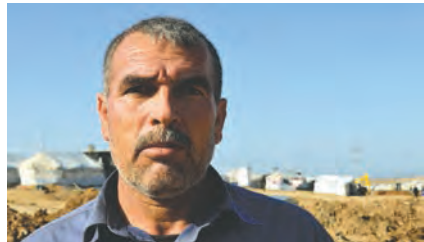
Cash-for-work in Khanke camp: “This job is like a breath of fresh air” © UNDP/Denise Jeanmonod.

Seven months later, while attending a short masonry course preparing for the construction of an extension of Baharka camp, he was not