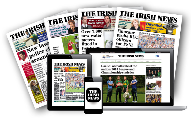
True to our words

Our responsive website enhanced with online videos, image galleries, live blogs and up to the hour breaking news attracts 23.6K DAILY USERS across mobile, desktop and tablet. Our newspaper is also available to download and view through our mobile app.