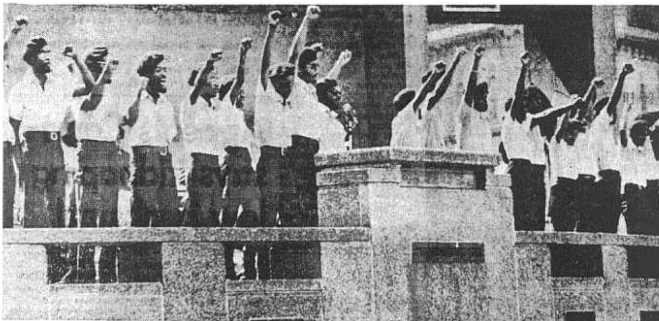
A rally for the Detroit 15.