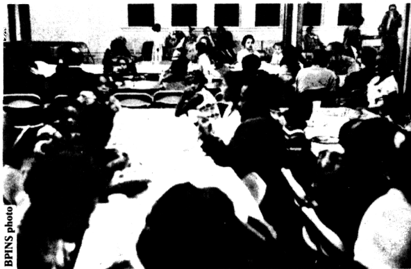
Thanksgiving Memorial Celebration sponsored by Seattle B.P.P. Chapter was attended by over 250 who came to honor Black people killed by police gunfire.