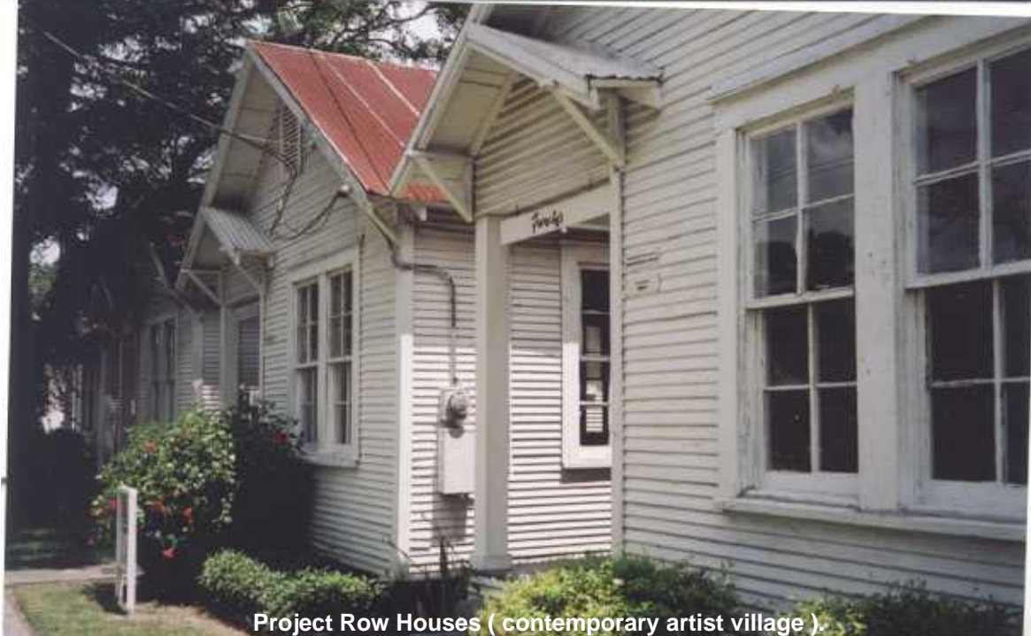
Project Row Houses ( contemporary artist village ).