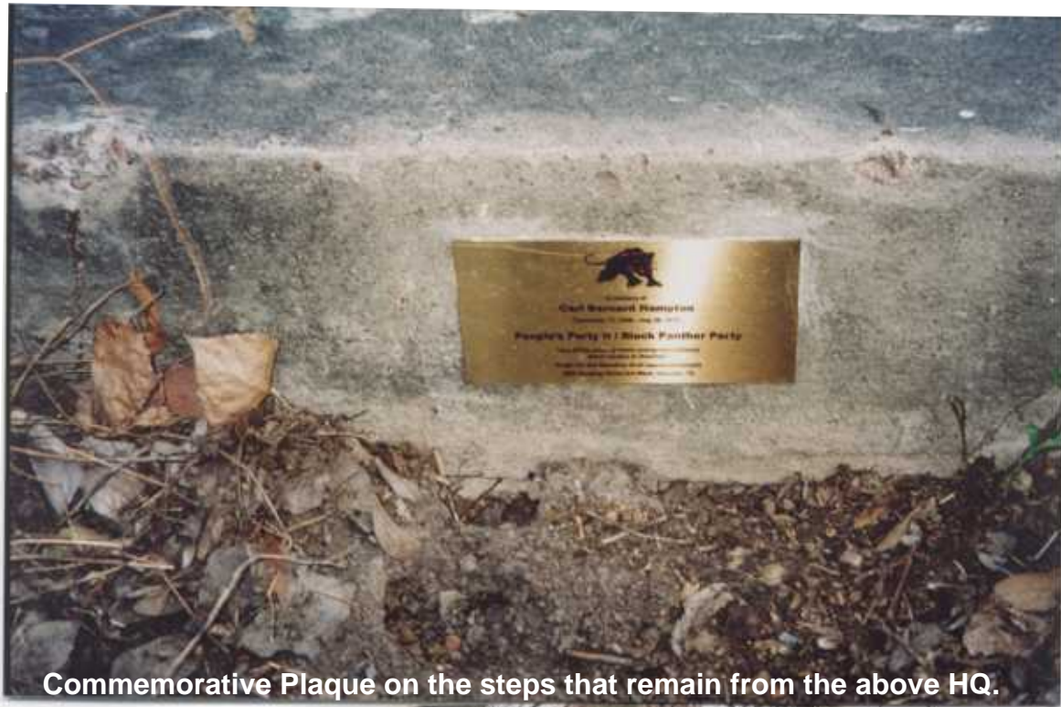
Commemorative Plaque on the steps that remain from the above HQ.