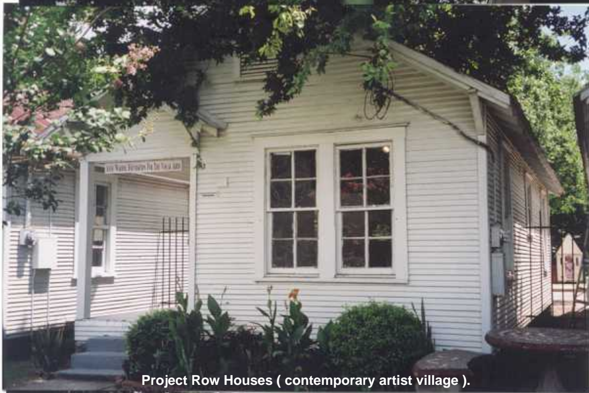
Project Row Houses ( contemporary artist village ).