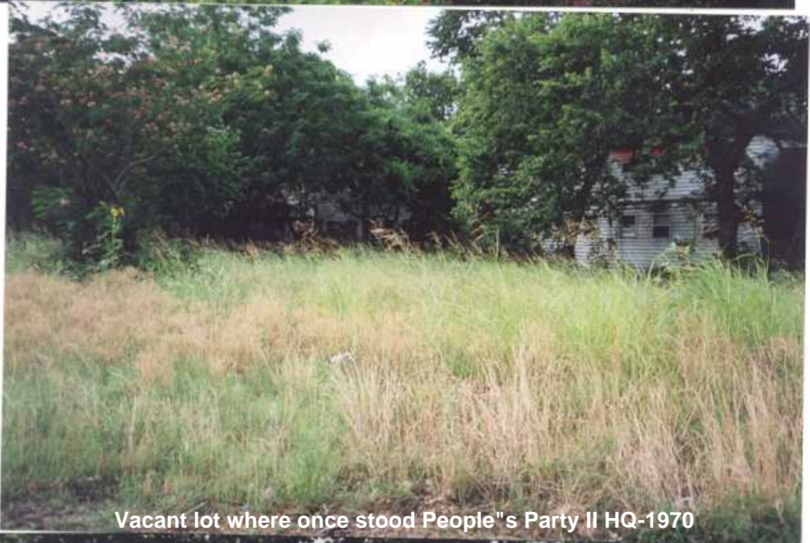
Vacant lot where once stood People's Party II HQ-1970