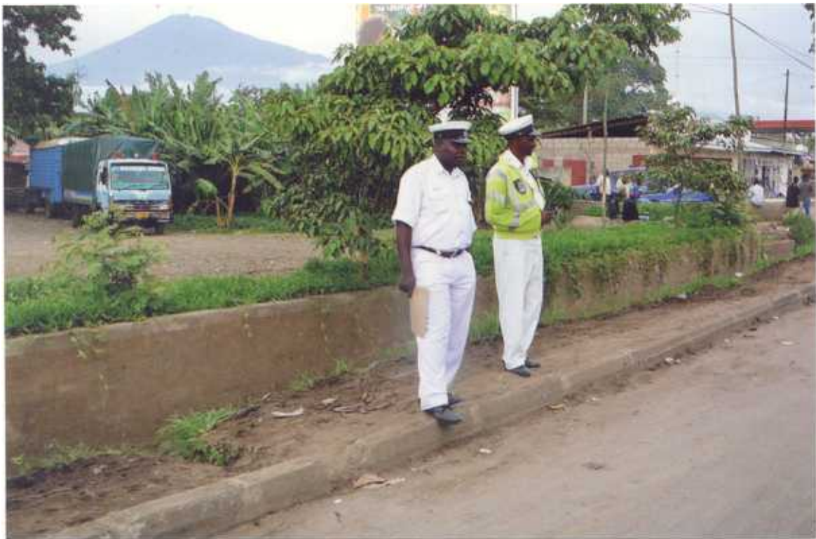
Mt. Meru in the distance, traffic officers on the street