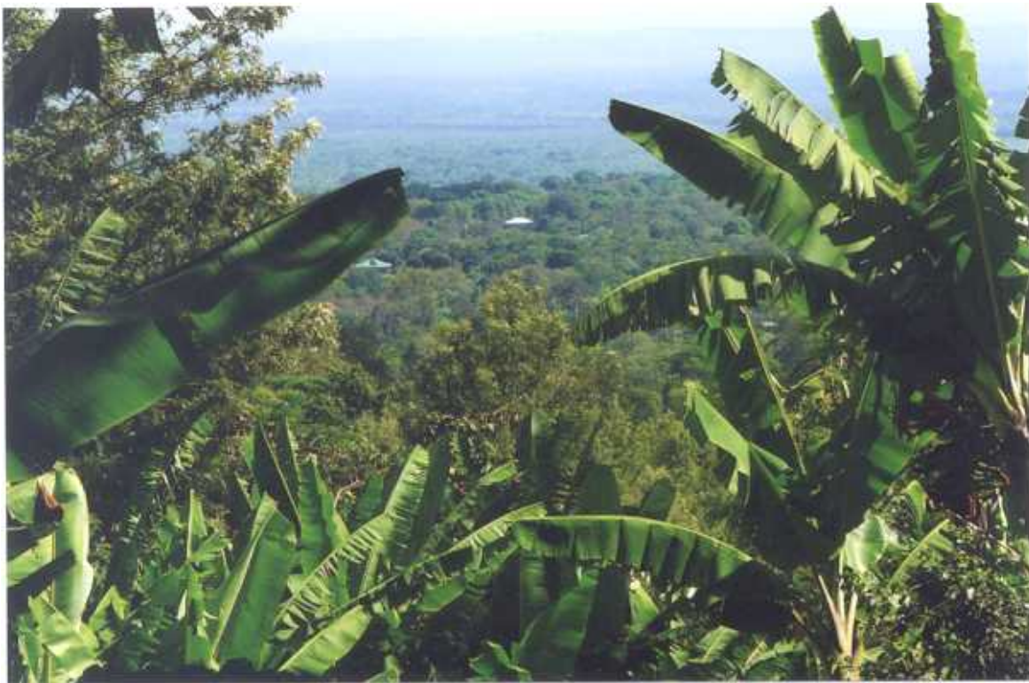
The view from the trail