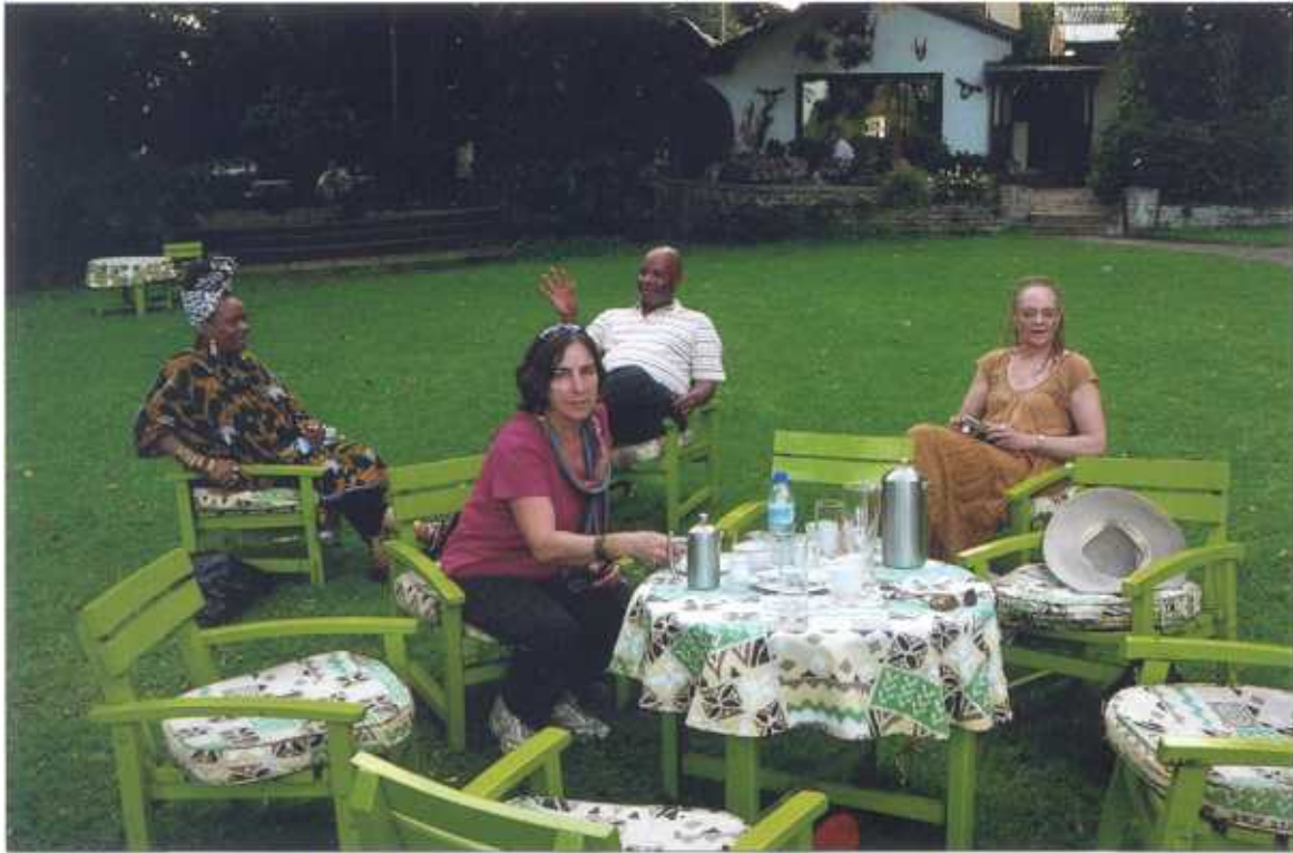
Relaxing at Mt. Meru Game Lodge and Preserve