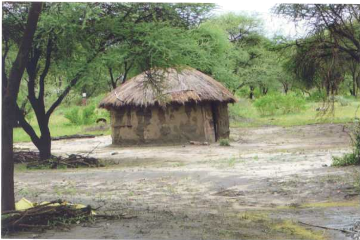
Traditional Masai house