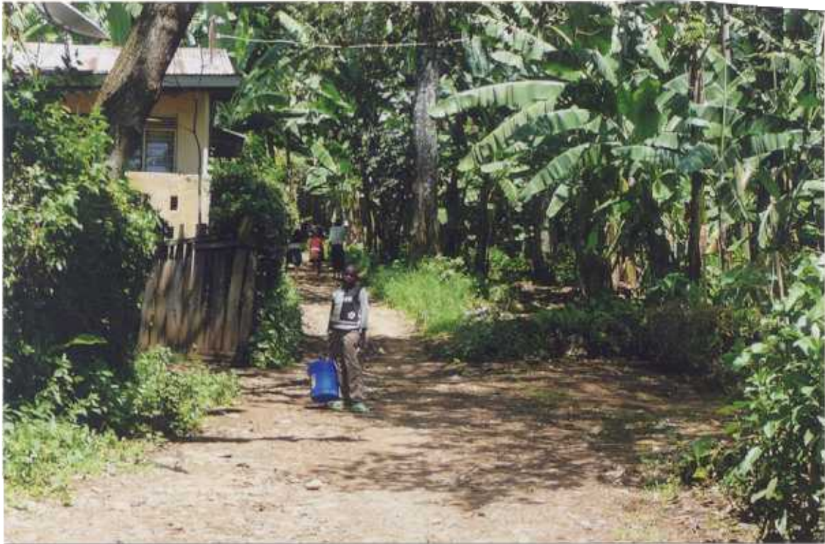
A steep climb up to the gorge