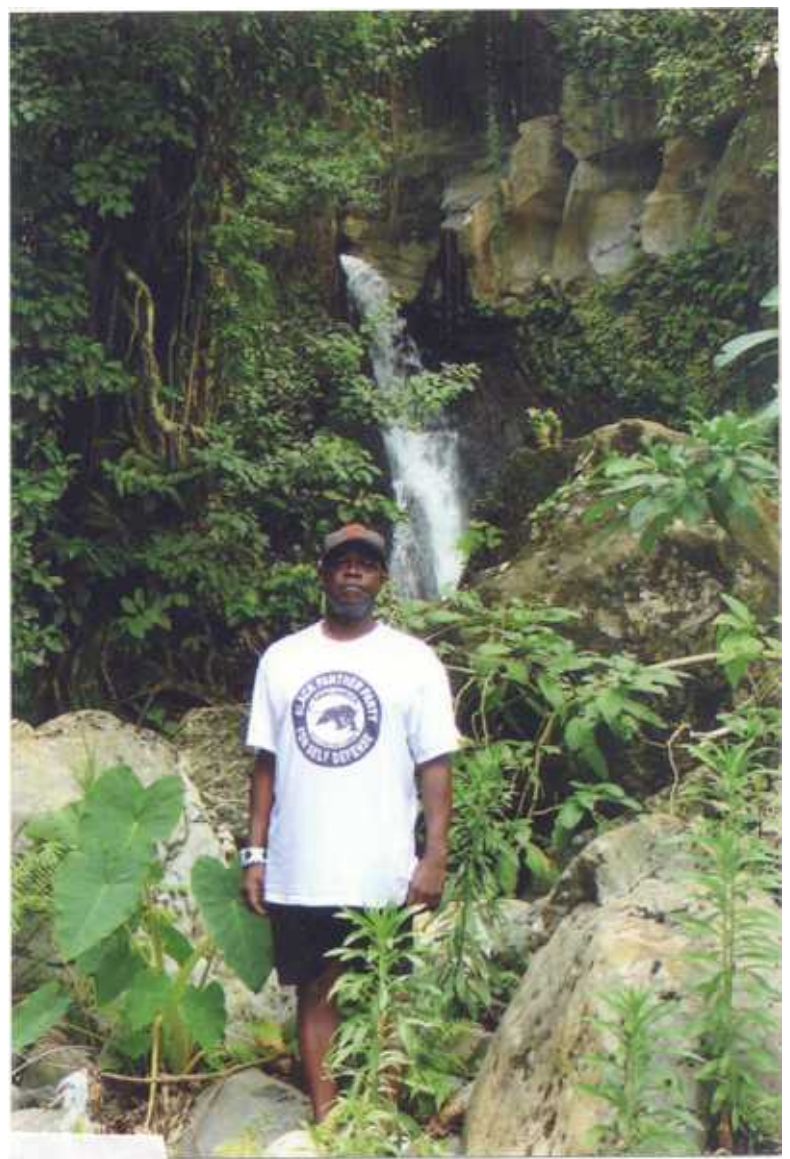
Photos from waterfall