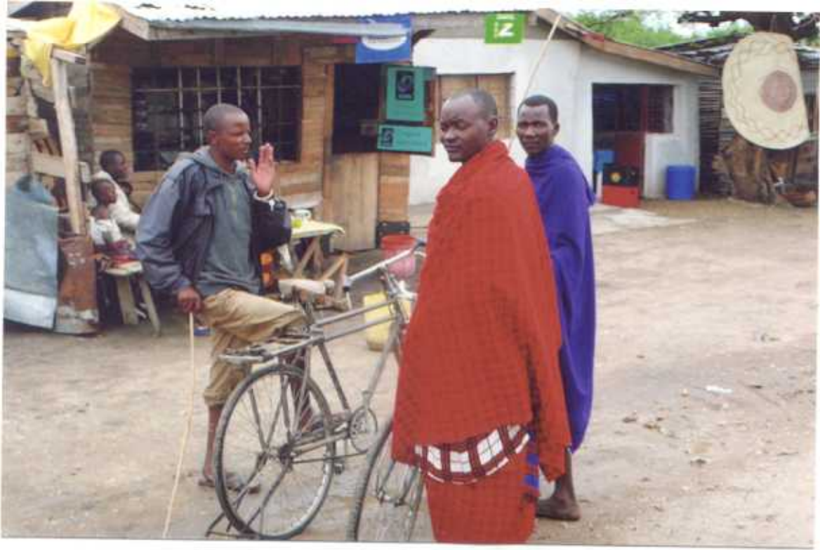
Masai men in village