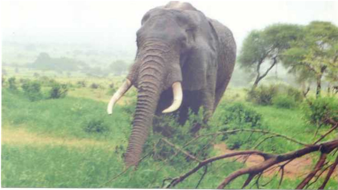
Elephants in the wild