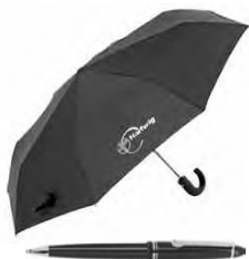
Pens and umbrellas personalised