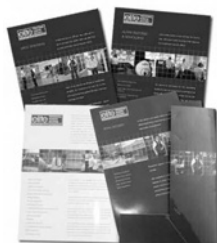
Brochures, leaflets and all corporate stationery