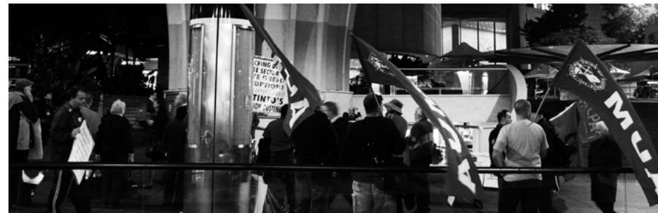
Demonstrators gathered for the 20 May 2010 rally outside Rio Tinto's Sydney office that was built around the call: “China is Cracking Down on Private Sector Corporate Greed and Corruption – It's Time that Happens Here! Stop Rio Tinto's Plundering and Union Busting!”. Among those participating were a contingent of representatives of the Sydney Branch of the MUA (Maritime Union of Australia) – carrying the union's trademark red flag.

Despite the power of the capitalist class, the working class in Australia is far from powerless to fightback. Since they do the labour that produces the bosses' wealth,