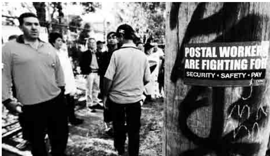
December 2009: Postal workers at a picket line. Tens of thousands of Australia Post workers held a series of strikes in the lead up to Christmas.

To the extent that the government does plan to expand services it is to be financed, paradoxically enough, by slashing jobs and quality. Often this is done through privatization which enables governments to pass the “responsibility” for cuts onto private operators. RailCorp has already started privatising by contracting out jobs like cleaning and station maintenance. This has been a dirty affair with some RailCorp executives handing out the contracts to their private sector mates at inflated prices. The government then shamelessly seizes on the resulting losses to declare that further contracting out is needed ... in order to improve “efficiency”! Most cynically, Premier Keneally is claiming that the only way the government can finance rail network expansion is by carrying out its unpopular plan to sell-off electricity generation. We say: Don’t fall for such divide and rule tactics! Stop electricity privatization – Smash all contracting out of rail services! Demand that the long overdue expansion of the rail network be financed by grabbing a chunk of the wealth of filthy rich tycoons – wealth that is after all derived from the exploitation of their workers!