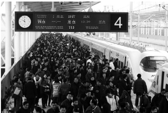
The world's fastest train service the newly opened Wuhan to Guangzhou express is operated by state-owned China Railways using trains designed and built by state-owned Chinese manufacturer CNR -Tangshan Railway Vehicle Co. The average speed of the journey is 350 km/h.

Their anger is understandable but leaving the union is a very bad move. It only weakens the fighting potential of workers. What's more it only makes it easier for the sell outs to justify their stance. After all, the argument that union bureaucrats always raise for a do-nothing stance is that workers are not powerful or organised enough to triumph in an industrial campaign. Politically aware workers should therefore channel the anger of workers into agitation for a strike and should re-recruit workers into the union to make the needed industrial action more powerful. There is indeed nothing like a solid strike to unite workers together and raise their spirits.