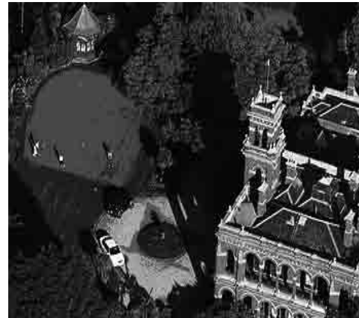
Raheen: The Pratt family's spectacular $40 million mansion in Melbourne. Meanwhile there are over 100,000 homeless people in Australia and 225,700 people on the official waiting list for social housing.

In a just society,any improvement in overall national wealth would go first to the most needy. However, in Australia the opposite has happened during the recent mining boom. Thus, in the period from the census in 2001 to the one in 2006, the homeless population actually grew by nearly 5,000. Since then the situation has become even worse due to the global economic crisis. As business owners lay off workers and slash the number of hours they call up casuals for, more people simply can't afford to rent the units they had been staying in. It is true that due to the strength of China's socialistic public sector which has held up Australia's lucrative China-bound exports, unemployment levels here have not risen as fast as in other capitalist countries. Yet the official unemployment rate which counts a person as employed even if they work as little as one hour a week hides the true story. On top of the official unemployment rate of 5.8% is an additional 8.1% of the workforce who are working less hours than they want to (according to August 2009 Australian Bureau of Statistics figures.) This latter underemployment rate has ballooned out by 50% in just a year so that now 1.5 million people in this country either can't get any work or are working less hours than they want to. When you add to this figure the discouraged job seekers who are not counted in unemployment figures because