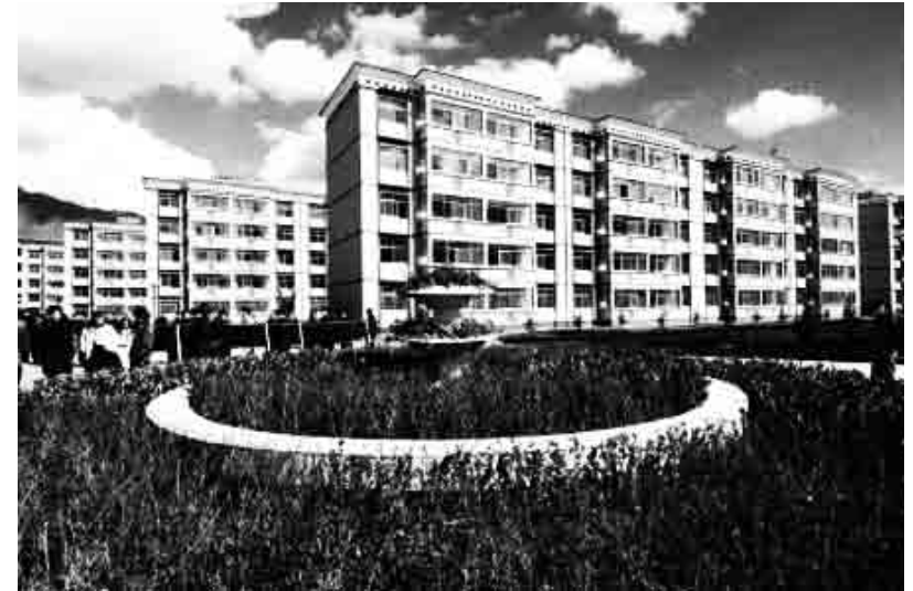
Public Housing in the People's Republic of China: Sunshine Home Residential Area in Lhasa, capital of China's Tibet Autonomous Region. In late 2008, socialistic China began constructing 9.9 million low rent public housing dwellings to be completed by 2011.

A third crucial criterion is that the left formation must base itself entirely on the methods of the class struggle. It would, of course, raise demands that crash up against the bounds of what is acceptable to the capitalist rulers – like, for instance, calling for a massive increase in public housing or for jobs for all. However, in raising these demands it should follow up by explaining that such demands cannot be realized by appealing to the good will of capitalist governments, courts or commissions. They can only be won through mass struggle. It is through the class struggle that the working class gets a sense of its own power and learns from its own experience that all the institutions of the capitalist state are its enemy.