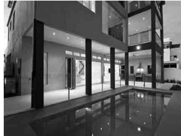
A luxurious 4-level (with lift access) home in the Sovereign Islands on the Gold Coast that was available for rent in July 2010 for a mere $2,450 per week! The capitalist “free market” leads to an abundance of opulent dwellings that most cannot afford and to a huge shortage of affordable rental accommodation.

Thus, for especially the poorest tenants and other renters with few options, the reality is very different to the formal rights that they are supposed to have. Many are bullied by the growing number of slum landlords in this country. Such slumlords typically squeeze several low-income tenants into small dwellings with poor facilities. Among those who are exploited by such landlords are international students. There are many cases where dodgy landlords crowd students three or four to a room in three-bedroom apartments. Yet there are examples of even more shocking overcrowding. One house in Sunnybank, Brisbane was found to have 37 overseas students herded into it ( The Australian , 23