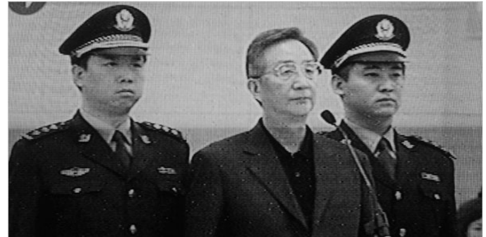
Position no immunity: Former Shanghai chief and Communist Party of China Politburo Standing Committee member, Chen Liangyu at his April 2008 sentencing hearing. Chen was jailed for 18 years for allowing state assets to be illegally acquired by private bosses in exchange for bribes.