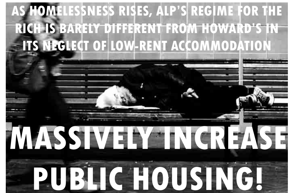
A more and more common reality in Australia: a homeless person sleeps the streets

Of course, the working class and Aboriginal people do indeed need a party. But this will be a party that will organise the mass struggle. A party that will unite Aboriginal people with the power of the union movement - and with non-white “ethnic” people who are also copping racism - in a common fight against racist tyranny and the oppression of the poor.