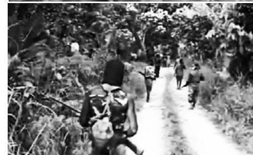
Taking a stand against Rio Tinto (whose Australian wing was then called CRA): Bougainville Revolutionary Army (BRA) freedom fighters in action. BRA rose up against CRA's failure to share revenue and provide proper compensation for its massive copper mine in the PNG island of Bougainville. Bougainville resistance forces shut down the mine in 1988.

Yet despite the firepower arrayed against them, the Bougainville resistance which had coalesced into the Bougainville Revolutionary Army (BRA) managed to force the mine to shut down indefinitely in May 1989. Australia/PNG responded by escalating the war. They used terrifyingly brutal methods. Herding the people of Bougainville into “care centres” (a Vietnam War-euphemism for concentration camps), many suspected of having sympathies for the rebels were killed or beaten. Still unable to defeat the BRA and reopen the mine for CRA (Rio Tinto), Canberra told the PNG puppet government to impose a naval blockade on the entire island and provided the Port Moresby regime with the aircraft, helicopters and Pacific Class speedboats needed to enforce the blockade. As a result, the island's people started dying from starvation and more commonly from