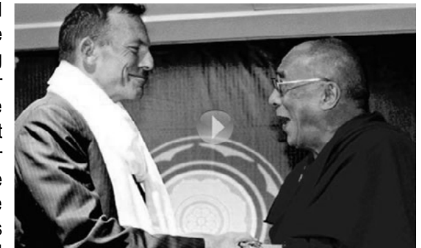
3 December 2009: A love in of two people who share a lot in common and both hate communism. Ultra-conservative leader of the Liberal Party, Tony Abbott meets deposed feudal monarch of Tibet the Dalai Lama.