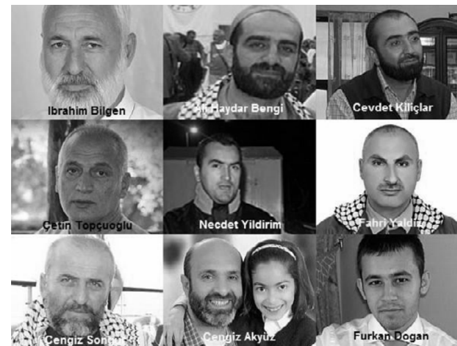
Faces of the nine activists - eight Turkish nationals and one U.S. citizen - murdered by Israeli forces during the raid on the Gaza aid flotilla, some from multiple gunshots to the back of the head at point blank range.

It is up to the working classes, freed from all imperialist influence, to sweep away the Iranian fundamentalist regime and indeed all the, at least as equally oppressive, U.S.-allied regimes in the region - from the horribly male chauvinist Saudi monarchy to the