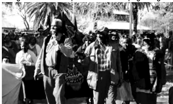
July 9, Alice Springs: Over 200 Aboriginal people and young anti-racists from throughout Australia march against the federal government’s racist “Intervention” into NT Aboriginal communities.

Thirdly, the government’s stigmatisation of Aboriginal people is aimed at diverting poorer white people from seeing who the real cause of their difficulties are – that is, the greedy ruling class. Such racist scapegoating is also whipped up against refugees. That the ruling class has no qualms about scapegoating this country’s first peoples shows not only how racist they are but also how worried they are about people’s anger over the lack of affordable housing and secure jobs.