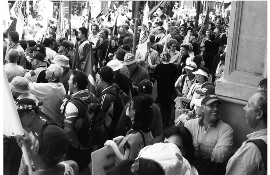
Sydney, 30 October 2009: Demonstrators gather outside Trades Hall and prepare to unfurl their union flags for a march through Sydney's CBD in protest against the ABCC.