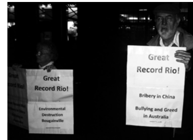
Demonstrators taking a stand at the May 20 rally in Sydney.

this is not the only or indeed even the main factor involved. What mainly drives the militant defenders of the arrested executives is, on the one hand, the class loyalty of capitalist politicians to capitalist executives and, on the other hand, the hatred that capitalist representatives have for socialistic states. If indeed it was only racism that was motivating the hardline backers of the arrested executives then why have ethnic-Chinese anti-communists also demanded a tougher line from Rudd against the PRC? For example, the Epoch Times , the paper of the Falun Gong group – a right-wing Chinese outfit posing as a religious organisation – published an article on 12 August 2009 headlined "Australia Needs to Stand Up for Stern Hu." Meanwhile, in attacking China's arrest of the Rio Tinto bosses, Barnaby Joyce, Michael Danby, Malcolm Turnbull and the Murdoch press highlighted not the racial or cultural characteristics of the Chinese people but the reality that in the "communist Peoples Republic of China" the key industries are dominated by state-owned enterprises; and that these enterprises operate not according to the profit motive but are subordinate to the state that is run by communists. However, you won't find any references to such statements by these people in the Socialist Alternative's journal. For if