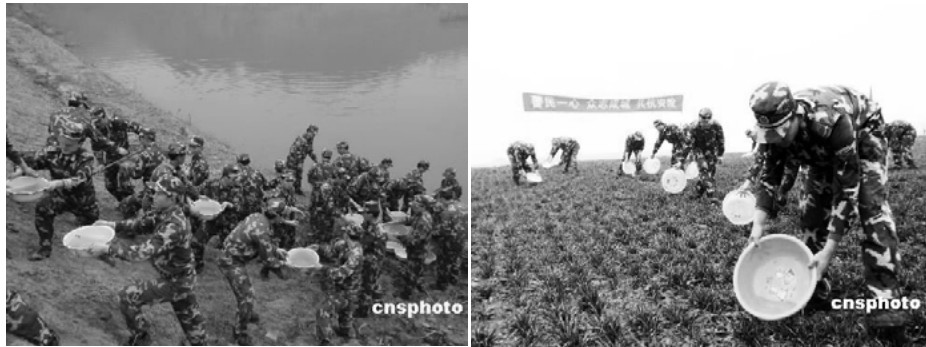
Serving the people. Feb 7, 2009: Several thousand of the Peoples Republic of China's police mobilise in Henan Province to help poor farmers combat the drought.

confidential information would have had to be known by Rio Tinto's Australian headquarters. The Shanghai office would not have had the authority to lower the price of ore sold to China's major state-owned customers or to suddenly transfer a ship of ore to a particular customer without the approval or at least knowledge of head office. Indeed, even in its frontpage March 24 article "exonerating" Rio Tinto, The Australian newspaper had to admit that: