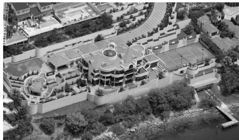
Perth mansion until recently owned by mining heiress Angela Bennett. Last year she sold the home to fellow mining magnate Chris Ellison for $57.5 million. Bennett became a billionaire through receiving royalties from Rio Tinto's Pilbara iron ore operations.