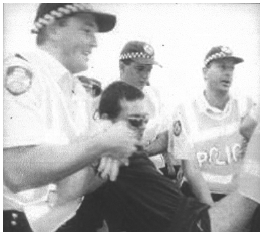
"Serving and protecting" ... Rio Tinto's interests! Queensland Police arrest hundreds of trade unionists outside Rio Tinto's Gordonstone (now called Kestrel) coal mine in February 1999. Pickets tried to stop non-union scabs secretly hired by Rio from entering mine after the entire union workforce had been retrenched when the mine was supposedly "closed."

certainly been well documented over the years that the Queen of England and associates of the British Royal family have a very big stake in Rio Tinto. However, the current exact value of their holdings is unknown.