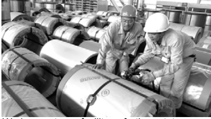
Workers at a facility of the state-owned Baosteel Group – China's biggest iron and steel enterprise. In China the equivalents of BHP, Rio Tinto, Woodside, Xstrata, Bluescope Steel, One Steel etc are all state-owned.

of receiving two bribery amounts and that he “did acknowledge the truth of some of those bribery amounts.” Other than the amounts of the bribes, the consulate general provided no further details. On the one hand this served to mask the full colour of the crimes conducted and on the other hand helped to play into the myth of a trial conducted “in the shadows.” The Australian bourgeois media then built the myth further by refusing to grill the Australian government for more details. The media never condemned Australian