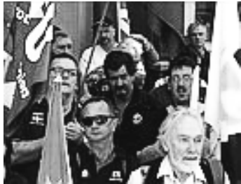
16 February 2010: Trade unionists rally outside Rio Tinto's Melbourne headquarters to protest the company locking out 560 union miners in the Western Californian town of Boron.

The statement went on to note that Rio Tinto was notorious for “abuses of human rights, indigenous land rights, workers’ rights and damage to the environment and local communities in Australia, Africa, Bougainville, Indonesia and Iceland.” And that is putting it mildly! Let us here briefly examine some of the history of Rio Tinto. Let us look at the ruthlessness of the Australian and British capitalists who run this company.