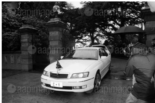
April 24, 2009: Prime Minister Kevin Rudd leaves after visiting the mansion of ill tycoon Richard Pratt, then Australia’s richest man. Despite the billionaire being a swindler, whom was found to have taken $700 million from the public through illegally conspiring with rivals to keep packaging prices high, Pratt was doted on by mainstream politicians to his dying day.

pet foods, soft drinks, baked beans etc - out of $700 million by illegally keeping packaging prices high. To set up the scheme, the executives deliberately used pre-paid mobile phones that could not be traced and held secret meetings in private homes, hotel rooms and suburban parks. After over a year of denials, Pratt finally conceded just prior to the Federal Court ruling that he had knowingly broken the law to fix the prices. Yet the system was such that he only received a fine and was not jailed. It was only seven months later that Pratt was finally