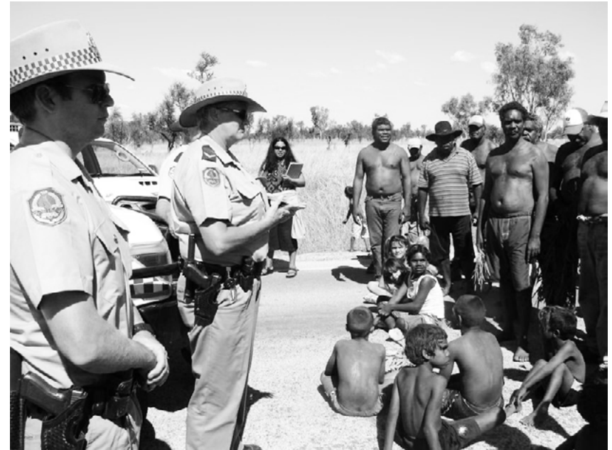
June 2008: Police block Aboriginal people in the Northern Territory's MacArthur River Region from holding a ceremony at a sacred ceremonial site that was on the verge of being destroyed by the expansion of a zinc mine owned by mining giant Xstrata.