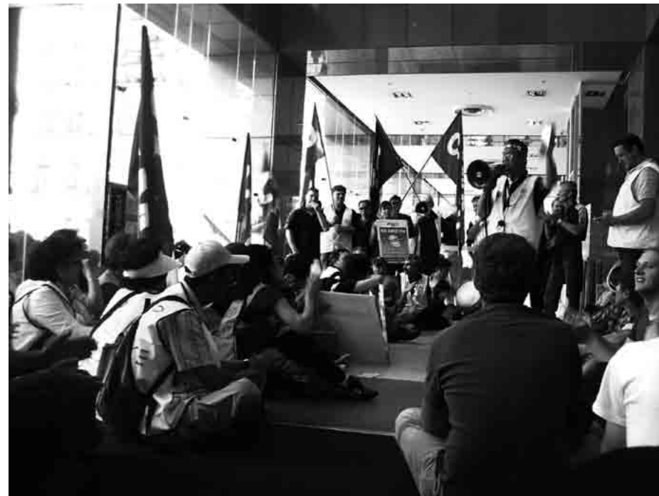
Sydney, 30 October 2009: CFMEU union building workers and their supporters occupy ANZ Bank headquarters in Martin Place in opposition to the bank's refusal to pay workers entitlements for a failed construction project that it had taken over. Including a large contingent of Korean-speaking unionists and their supporters, a highlight of this action was the multiracial crowd being led through chants of "The Workers United Shall Never Be Defeated" in both English and Korean! Despite attempts by the NSW police, hands on gun holsters, to intimidate the crowd the protestors held their ground until ANZ bosses agreed to a meeting with union officials. The organised workers movement has the power to smash the ABCC and defeat all the 'Workchoices Lite' anti-strike laws.

Indeed, for all the harmful inroads that the Beijing government has allowed capitalists to make into China's socialistic system, at least there the justice system is weighted against greedy tycoons (China's richest person, Huang Guangyu was last month jailed for 14 years for economic crimes) and corrupt politicians. Here it is the opposite. The capitalist elite is above the law while the harshest treatment is meted out to union activists, Aboriginal people and unemployed workers. That is why the working class has no obligation to be bound by the diktats and anti-strike laws of the Australian state. Instead, we should mobilise our industrial power in such a powerful and united way that the anti-worker state will not be able to stop us from winning justice.