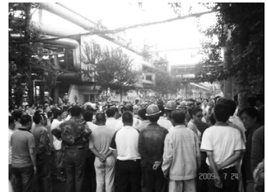
Jilin Province, China, 24 July 2009: Militant street and factory occupation by thousands of steel workers. Workers action smashed attempt to privatise the state-owned Tonghua Iron and Steel Group.