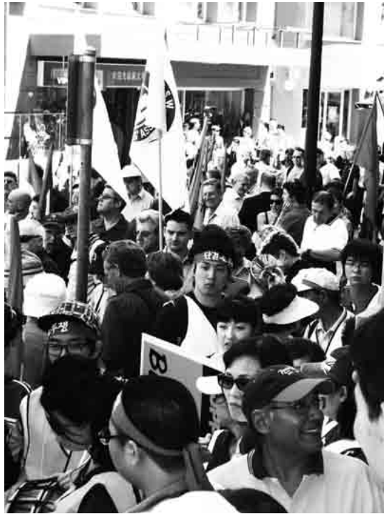
Workers of many colours gathered in Sydney to protest against the ABCC on 30 October 2009. Racism is poison to the workers movement as maximum unity is needed in its fight against the bosses and their capitalist state, always ready to use 'divide & conquer' to turn worker against worker.

The worst thing about the capitalists' racist diversionary tactics is that they can work and at the moment in Australia they are working.