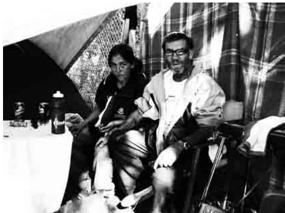
People sit in their camp in Redcliffe, North of Brisbane. Desperate homeless people have gathered in this "tent city" in a shady corner of a park

infamous how long people have to wait before they get any public housing – some people have been on the waiting list for 15 years – there are actually twice as many poor people eligible for public housing who have not bothered to get on the waiting list as there are people on the actual list. Moreover, the criteria for getting on the waiting list has been made so stringent in recent years (an annual income of less than $22,880 is now required) that most low-paid full time workers cannot even make