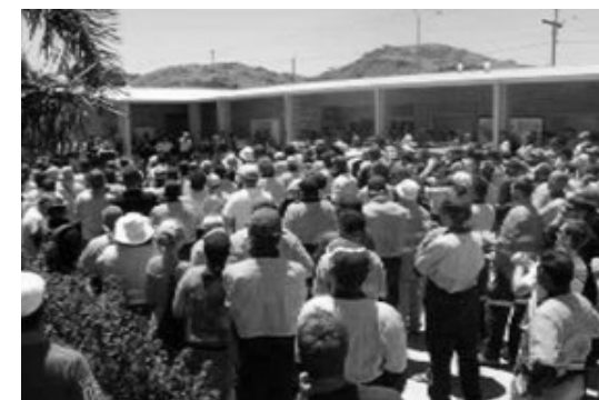
Construction workers involved in Woodside’s Pluto gas project strike over the failure of their bosses to grant them permanent accommodation. The strikes at the remote WA site involved 1,500 workers. Workers united have the industrial muscle to push back the corporate owners.