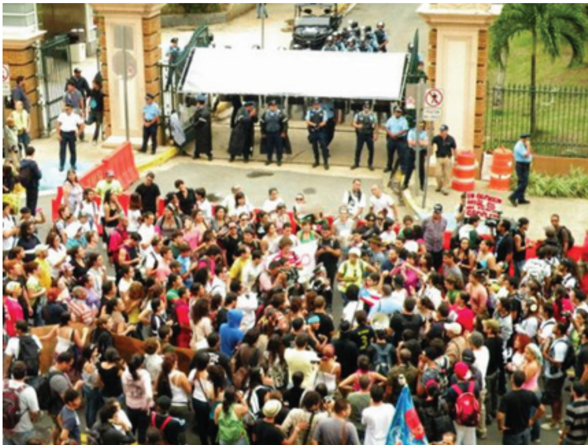
University of Puerto Rico students and supporters face off against riot police.

For more news and photos, check out Indymedia Puerto Rico at http://pr.indymedia.org